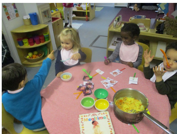
Baby food play