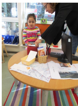
The Ticket Office

In the garden, the book making continued with books about our families and us as babies. This gave the children the opportunity for emergent writing and reflecting on past events.