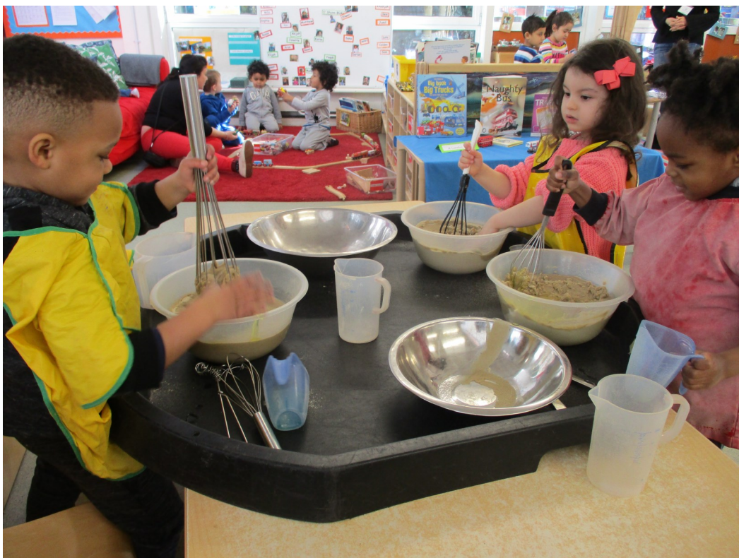
Getting messy with 'Gloopy' sand