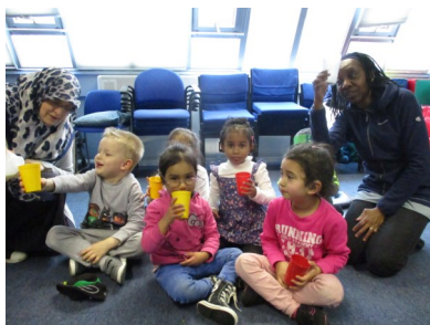
Hot chocolate in the Library

We are continuing to go on visits as part of 'The Serpentine Project'. Play can happen anywhere with anything. The children are so engaged that even a nearby park did not distract them. They are determined to take part in the weekly trip whatever the weather