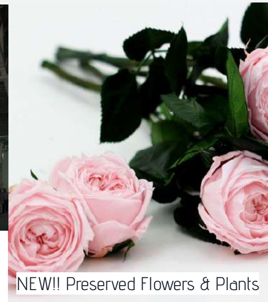
NEW!! Preserved Flowers & Plants