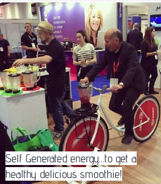
Self Generated energy...to get a healthy delicious smoothie!