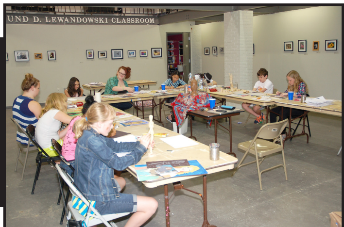
EDMUND LEWANDOWSKI CLASSROOM GALLERY