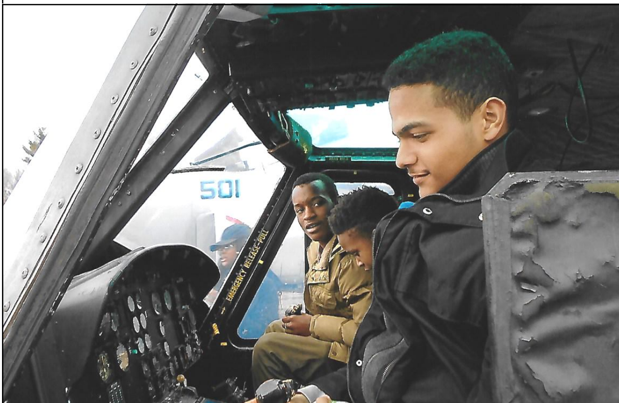
Students checking out ESAM's HUEY helicopter