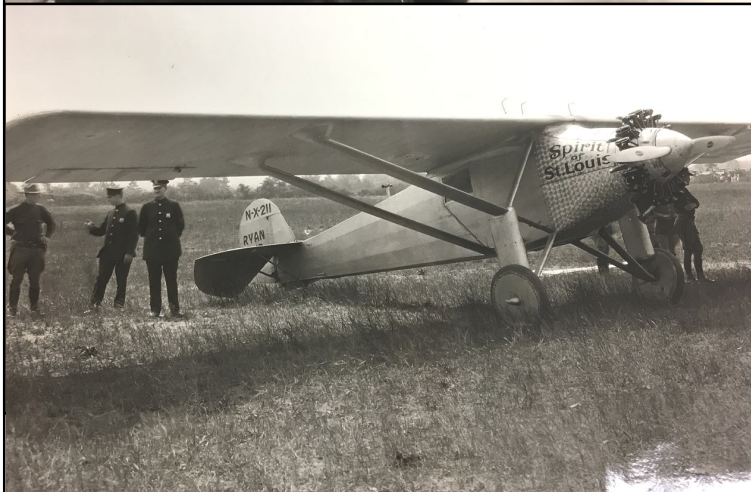
(Top) Charles Lindberg (standing at the right) (Bottom) The Spirit of St. Louis Both photos were taken at Schenectady County Airport on July 28, 1927.