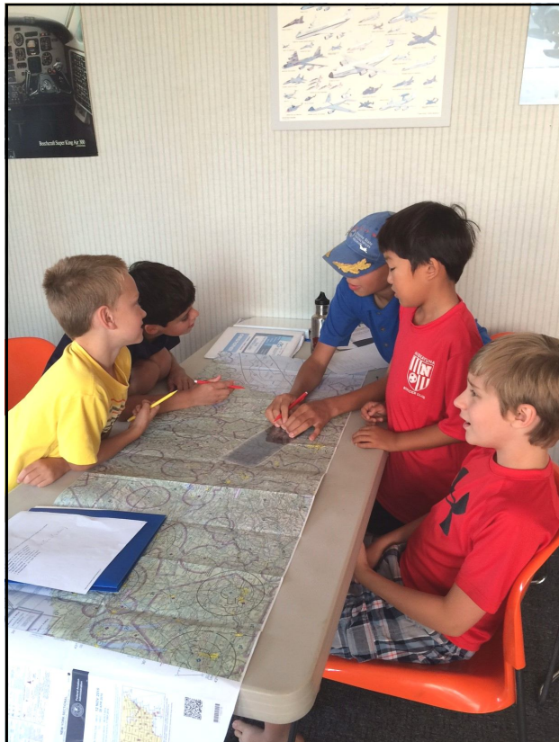
Planning a Flight at ESAM's Summer STEM Program

Students, ages 13-16 years, will spend the week at the Empire State Aerosciences Museum, located at the Schenectady County Airport in Glenville, learning about aviation, what real pilots do, and careers in aviation. Students in this hands-on class will team-up into groups to plan their "flight mission" alongside mentors while learning to read aviator maps, understand the forces of flight - how airplanes fly (thrust, lift, drag and flight control) and present their missions at their graduation celebration. This course will include guest speakers such as a Naval Aviator, a Civil Air Patrol Cadet and others. Students will have a guided tour of the museum's incredible exhibits and airpark, which feature more than 20 historic military aircraft. Students will also have the opportunity to work with the Experimental Aircraft Association (EAA) Chapter 602 to become Junior EAA members, which includes a half-hour flight. This course will be taught by the Empire State Aerosciences Museum.