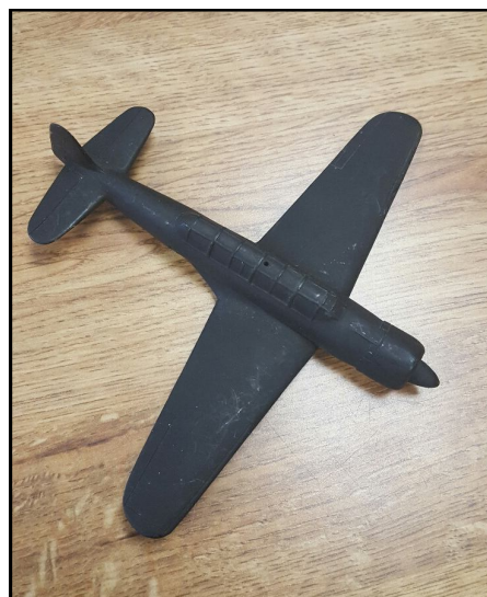
Nakajima C6N Aircraft Recognition Model