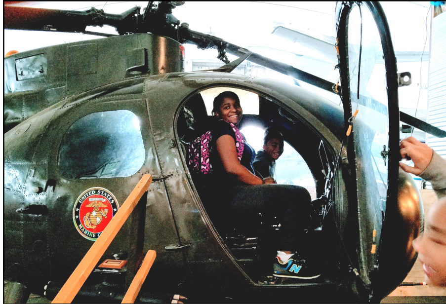
Troy Middle School Seventh Graders Enjoying their Visit to ESAM