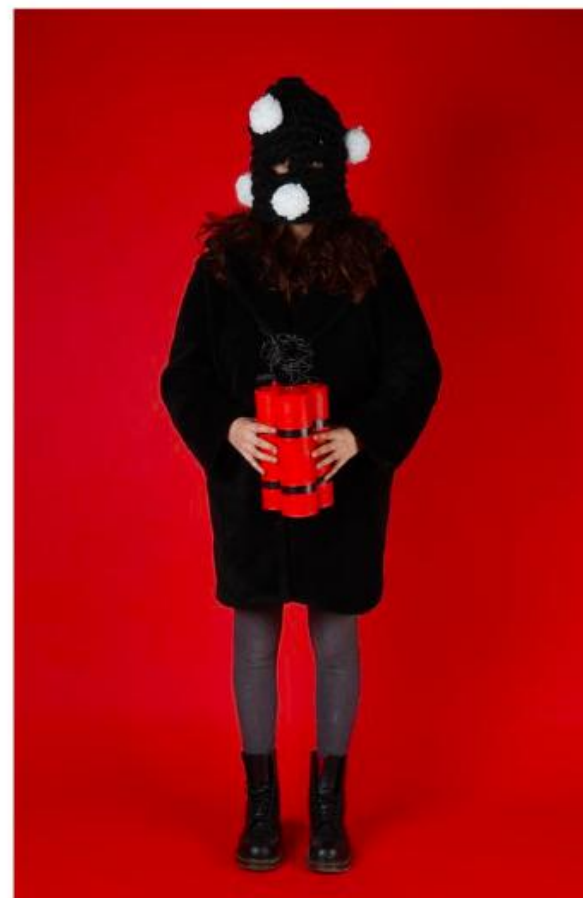
TICK TICK BOOM, 2019