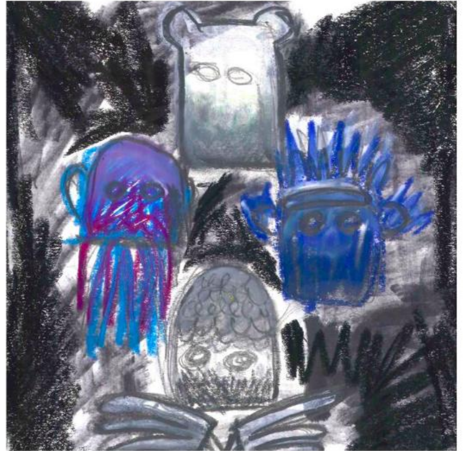
ON THE RIGHT: MASK DRAWINGS, MIXED MEDIA, 2019