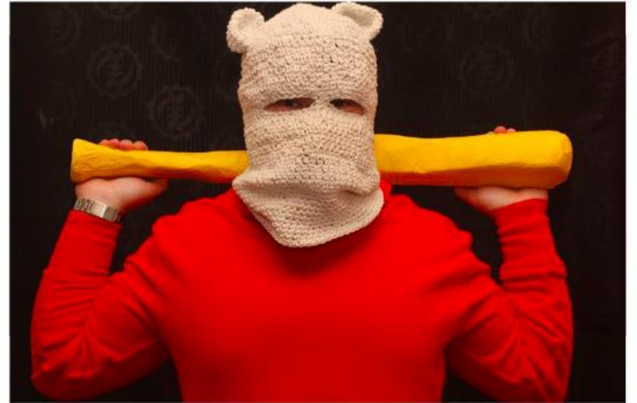
WHACK BANG SPLAT, 2019