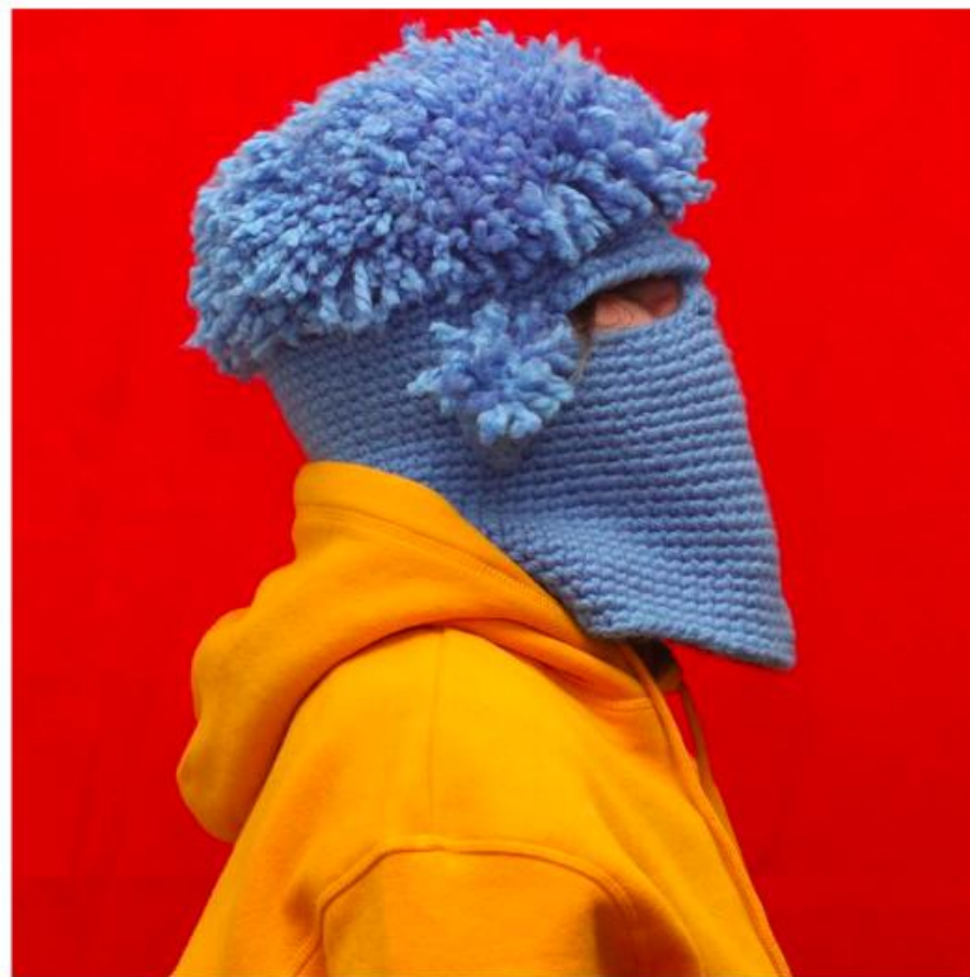
WHACK BANG SPLAT, 2019