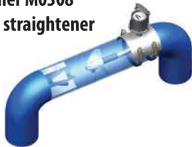
Mc Propeller M0308 with flow straightener