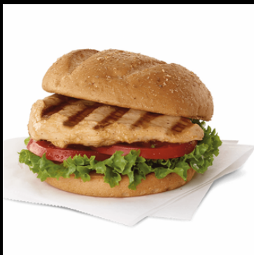
Grilled Chicken Sandwich (390 Calories)