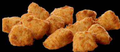
12 Ct Nugget (380 Calories)