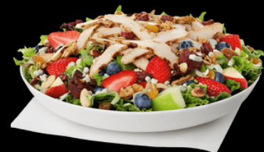
Market Salad (No Dressing/Light Italian) (330 Calories)