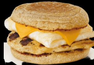
Egg White Grill (290 Calories)