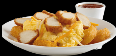
Hash Brown Scramble Bowl (470 Calories)