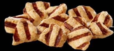
12 Ct Grilled Chicken Nuggets (200 Calories)