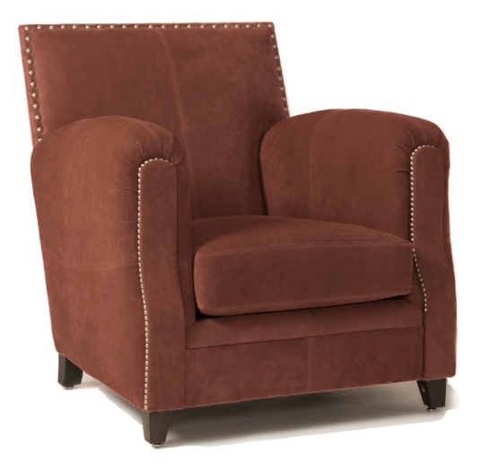
* Shown slipcovered with pinched stitch on front arms, seat and outside back

* Shown upholstered with applied front panel and nail head. Double needle on all seams.