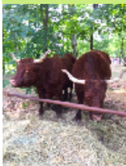
Oxen - these magnificent beasts were standard farming 'kit' in the 1880s

(The daughter of Netgie Lechevre, a Club member, wrote and narrated the commentary for the show).