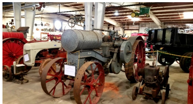
1914 Titan Tractor