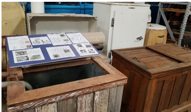
Early Washing Machines