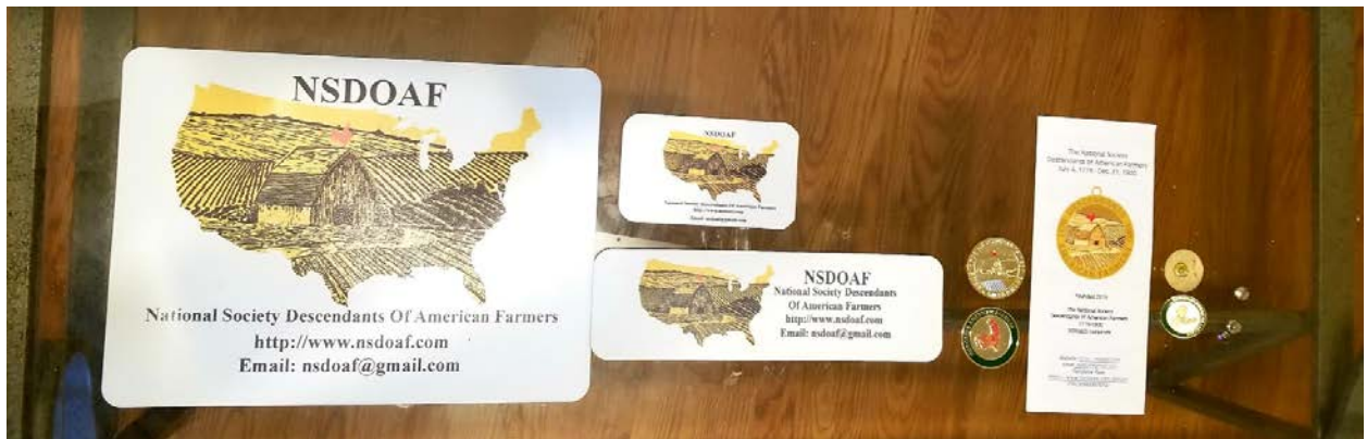
Large magnet, small magnet, bumper magnet, challenge coin (front & back), pamphlet, lapel pin (front & back), & lock backs