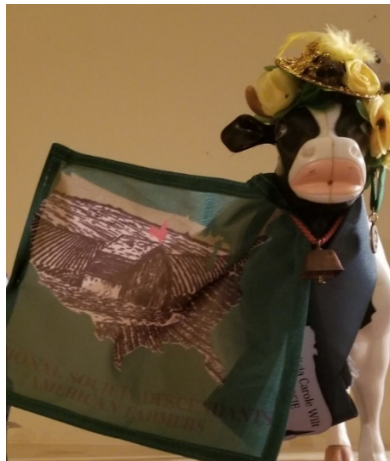
Rosie – Mini Flag