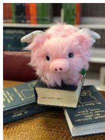
Justice the Piggy