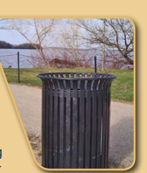
When possible, dispose of unwanted bait in the trash at access points. Never release them into the environment

If possible, dispose of ALL unwanted bait (including earthworms) in a trash can at the boat landing or access point. Otherwise, take them home and dispose of them by placing them in the trash, composting them, or using them in a garden as fertilizer. Likewise, other aquatic plants or animals that you collect, or buy in a pet store, should NEVER be released into the wild.