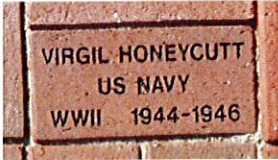
4 X 8 example

If no answer, please leave a message and we will return your call as soon as possible.