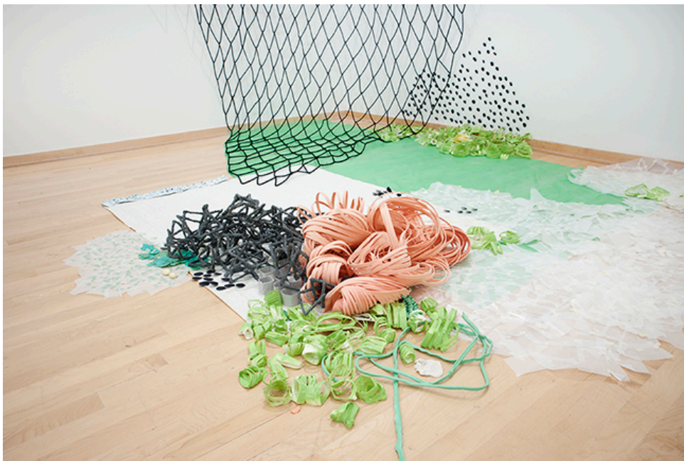
Amanda McCavour, MFA Thesis Exhibition: Flux , 2014. 50 x 60. Flocking, fabric, glue, ink, paper, thread, straws, Mylar, plaster, paint, plastic, tape.