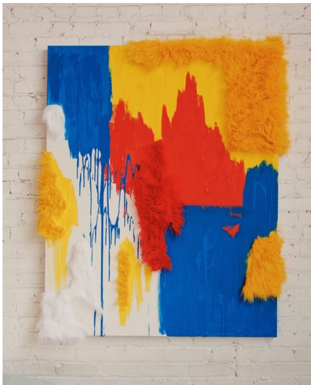
Uzmaki Cepeda, Nana , 2017. 48 in' x 60. oil and faux fur on acrylic