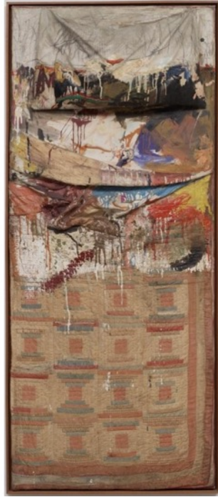
Robert Rauschenberg, Bed , 1955. 75 ¼ in' x 31 1/3 x 8" Oil and pencil on pillow, quilt, and sheet on wood supports.