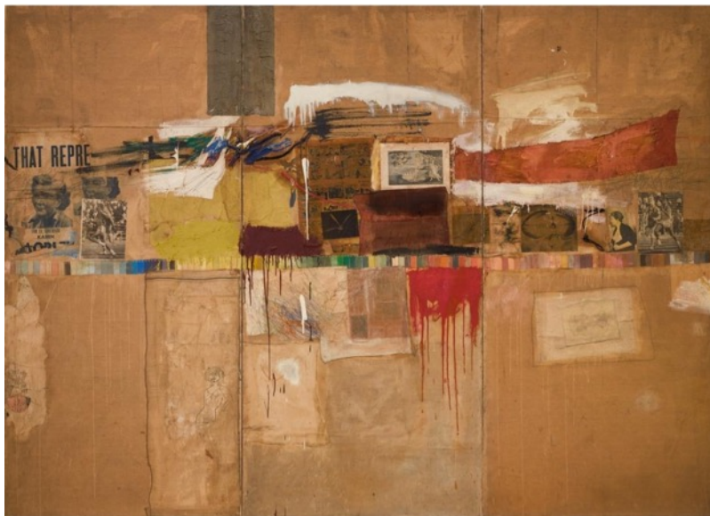
Robert Rauschenberg, Rebus , 1955. 8' x 10' 11 1/8 in. Oil, synthetic polymer paint, pencil, crayon, pastel, cut-and-pasted printed and painted papers, and fabric on canvas mounted and stapled to fabric, three panels.