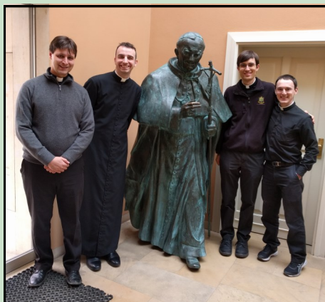
With friends at the museum in Poland.

Despite the workload, I still found some time to travel a bit.