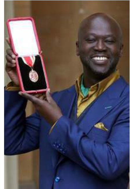
Sir David with OBE award

DA: I think Ghana has always been a small country punching well above its weight. We are the 'Black Star', the example that liberated the Continent. I always remember stories being told by my family and dear friends around the world of when independence happened, other African nations, other people,