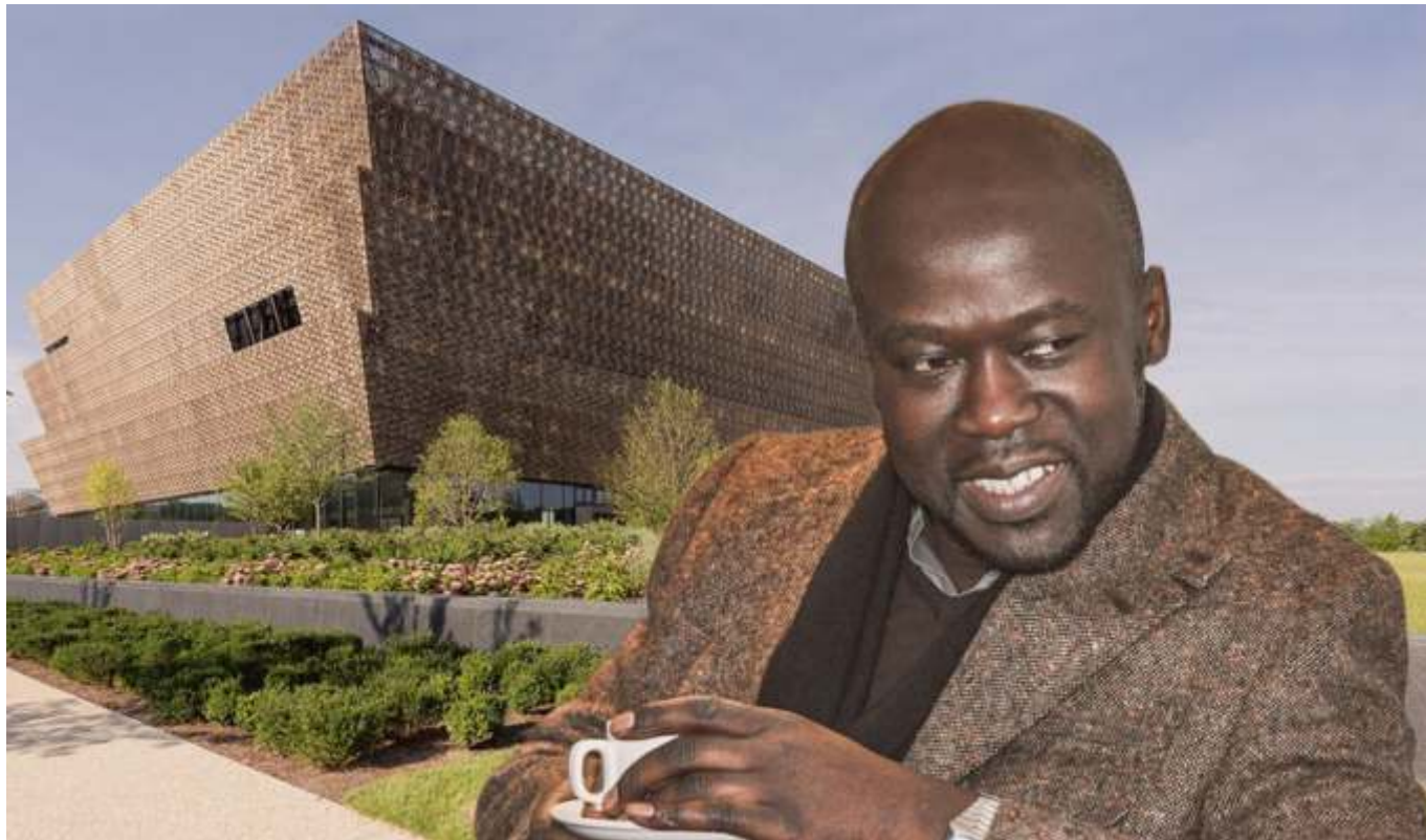
Sir David Adjaye by the Smithsonian Museum of African American History and Culture, which he designed

been used in this country, bringing that expertise to us, and making us leaders in our region for this kind of architecture. This is something that good architecture can produce. It can raise standards in our industry, and allow more employment, and more jobs, the capacity to be able to do more in our nation in terms of the built environment. And this is also very exciting. By its very nature, a project of this scale sparks a leapfrog effect, offering greater access to resources and technologies that may ordinarily not be accessible, further positioning Accra among key African cities to visit. Accra will join many global cities known for attracting visitors and local groups to historic landmark sites and the National Cathedral will from inception unlock a robust skills and job creation matrix in line with the vision set out by President Akufo-Addo for a 'Ghana beyond Aid'. What I believe Ghana's leadership envision here is a process of catalyzing local resources, both human and natural. It is about optimizing investments in our people, building