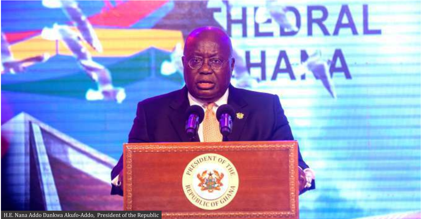
H.E. Nana Addo Dankwa Akufo-Addo, President of the Republic

H.E. Nana Addo Dankwa Akufo-Addo : President of the Republic