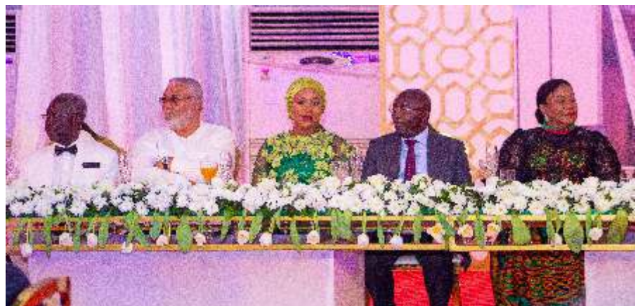
Veep Dr. Mahamudu Bawumia, First Lady Rebecca Akufo-Addo and H.E. Nana Addo Dankwa Akufo-Addo, President of the Republic

“Secondly, 71% of the Ghanaian people adhere to the Christian religion, grouped under the various persuasions of the Christian faith. The interdenominational