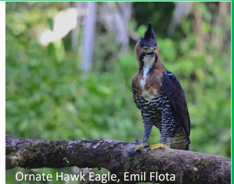
Ornate Hawk Eagle, Emil Flota

The hummingbird buffs will have a full dozen to choose from, or search for! This will be a