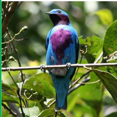
Lovely Cotinga, Jeff Chemnick

Set inside a 3,000 year old Maya plaza and surrounded by 500,000 acres of conservation land, over 370 species of birds have been documented at Chan Chich Lodge . It is known as one of the world's best places to spot Jaguars, Pumas and Ocelots in their natural habitat. A few of the most spectacular and rarer species that can be seen here with some luck are the Lovely Cotinga, Ornate Hawk-Eagle, Agami Heron, and Rose-