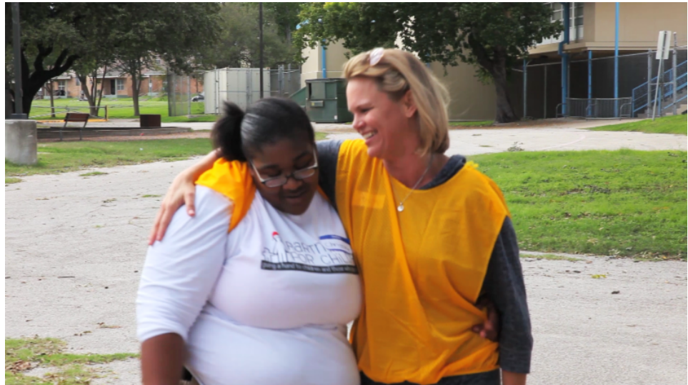
A graduate of the YES Financial Program and a happy mentor.

Continuous Improvement - Through feedback and other input, we are always improving.