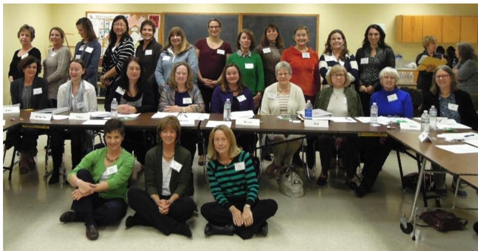
The Famiy FAC chose six organizations to submit full grant applications.

Our 130 hardworking Focus Area Committee (FAC) members have been busy the past 3 weeks reading, researching and analyzing the 114 Letters of Inquiry (LOIs) received by Impact Austin this year. After much discussion and careful consideration, we have invited 30 organizations to submit full grant applications (see list by committee below). Grant applications are due on February 21st and the FACs will be back to work reviewing those the last week of February.