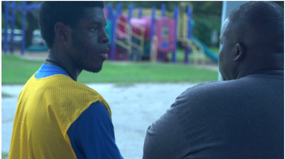
Mentor relationships vary from weekly phone calls to fun all around activities.