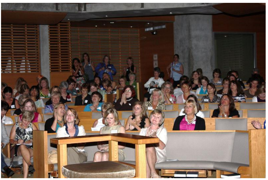
Impact Austin members hear grant recipient results at the 2011 Annual Meeting

Please visit <u>our website</u> to learn more about becoming an Impact Austin member. Online Membership enrollment and payment will be available on the website by the end of August!