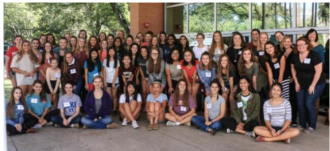
2015-2016 g3 members and advisors

Impact Austin's youth initiative, Girls Giving Grants (g3), has its largest class to date with 70 girls participating in the grant making process. Demand was so high for participation that applications were closed early! Members are currently busy reviewing 37 grant applications from local youth-serving nonprofits, meeting at the The Girls' School of Austin that has graciously provided space for their activities. Grant finalists will be selected in February.