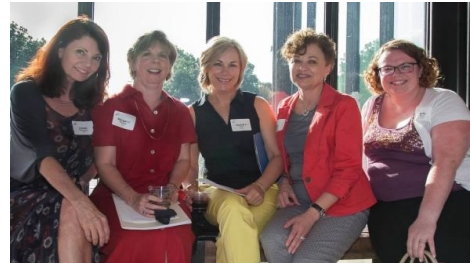
Members enjoy meeting and catching up.

Our organization continues the momentum toward an amazing 2016. Our next membership event will be Wednesday, December 2nd from 6:00-7:30 PM at the Austin Custom Winery on Brodie Lane . Grab a friend and mix and mingle with other Impact Austin members and prospective members.