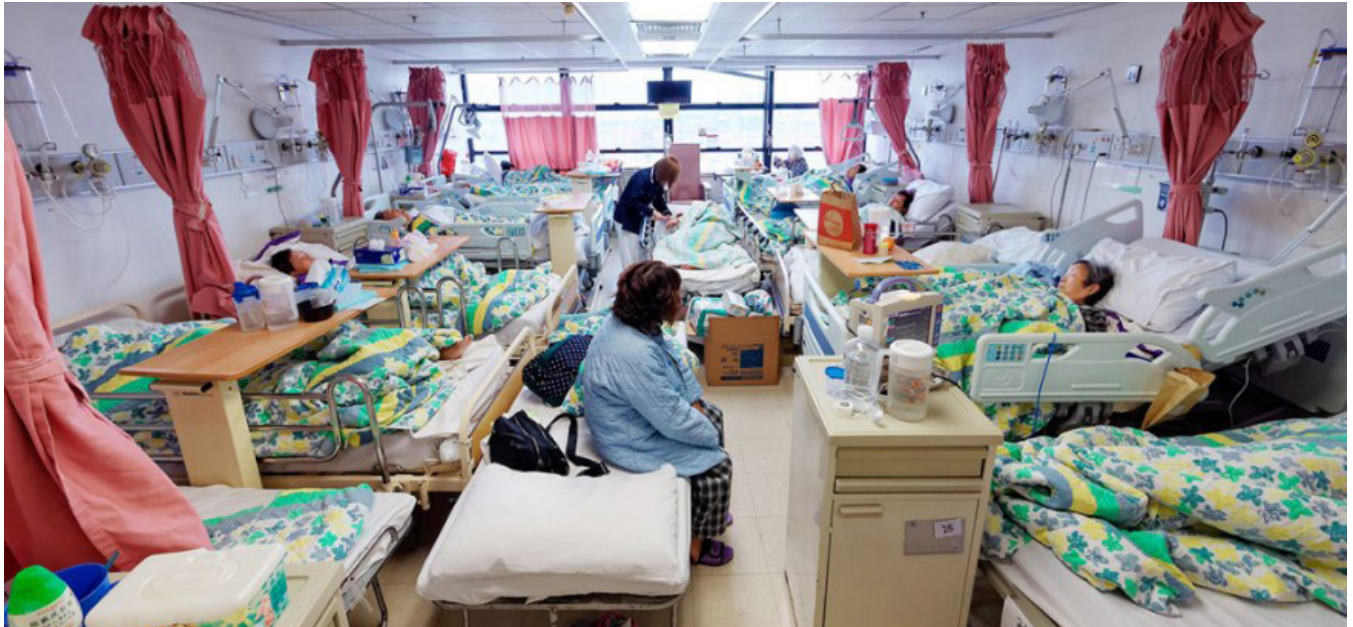
Public hospital bed occupancy situation.