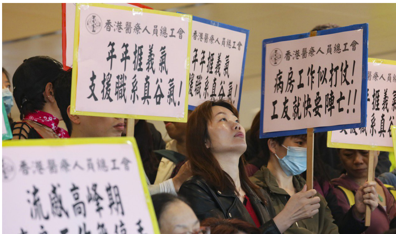
Public hospital supporting staff protest against manpower shortage.

be added within these four years. The total number of University Grants Committee-funded Universities for nursing students will increase from 630 to 690 places and 690 to 750 places in 2019-2020 and 2022-2023 academic year respectively.