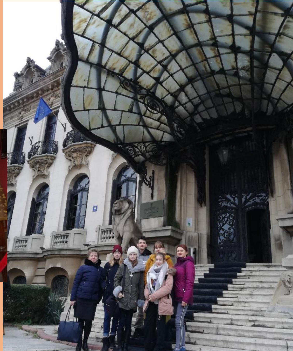
The National Museum "George Enescu"