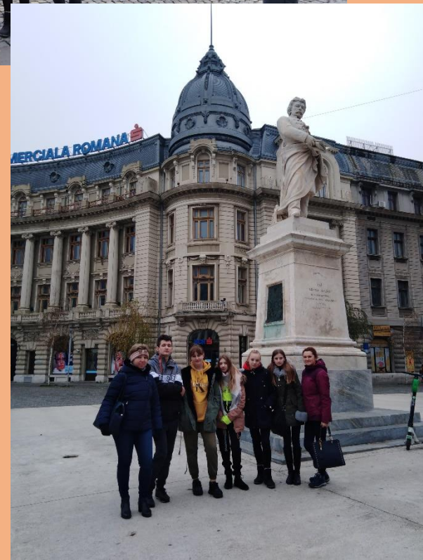
Visiting the Old Town in Bucharest