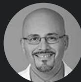
Mahmoud Khaimi, MD (USA)

Saturday 12th October 10:00 - 11:00am 3:00 - 4:00pm