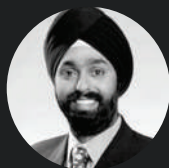
Paul Singh, MD (USA)

Saturday 12th October 10:00 - 11:00am 3:00 - 4:00pm