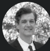
David Lubeck, MD (USA)

Sunday 13th October 10:00 - 11:00am 3:00 - 4:00pm