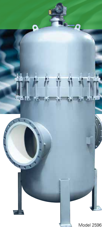
Model 2596 20"

MONEL® is a registered trademark of Special Metals Corporation group of Companies.