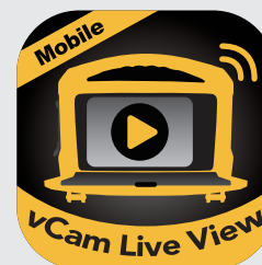
Live View Phone and Tablet App