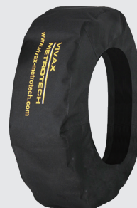
MX Drip bag