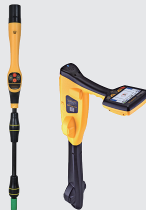
VM-540 and vLoc3-Cam