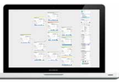
FACTUAL PROJECT DATA