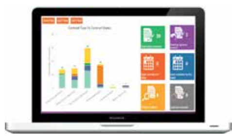
VISUAL INTERPRETATION OF PROJECT