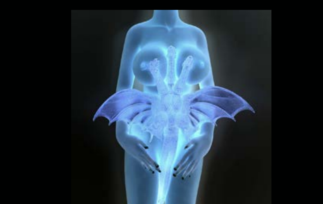
Possession 20,000 thb digital print on organic washi paper 44x44 cm - 2018 - Ed/3