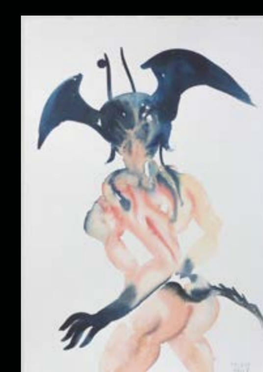
Devil 25,000 thb Watercolor on paper 30x44 cm - 2018