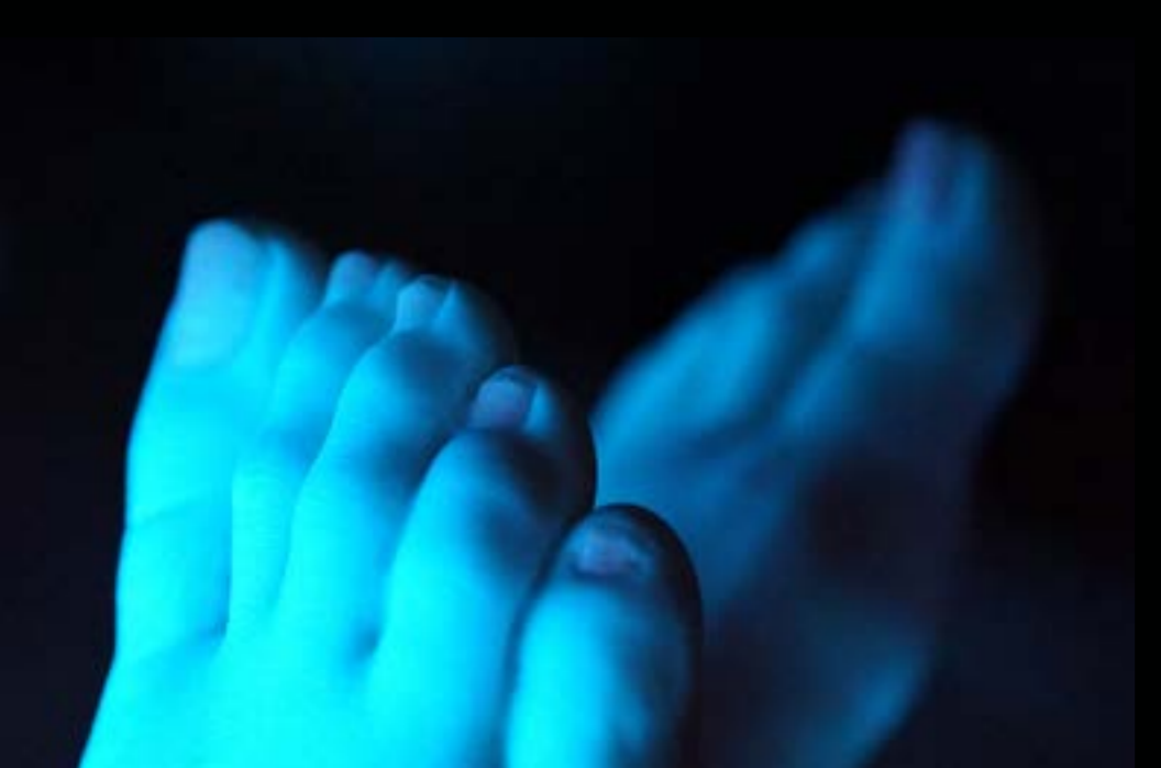
Cold Feet 10,000 thb digital print on organic washi paper 44x29 cm - 2018 - Ed/3