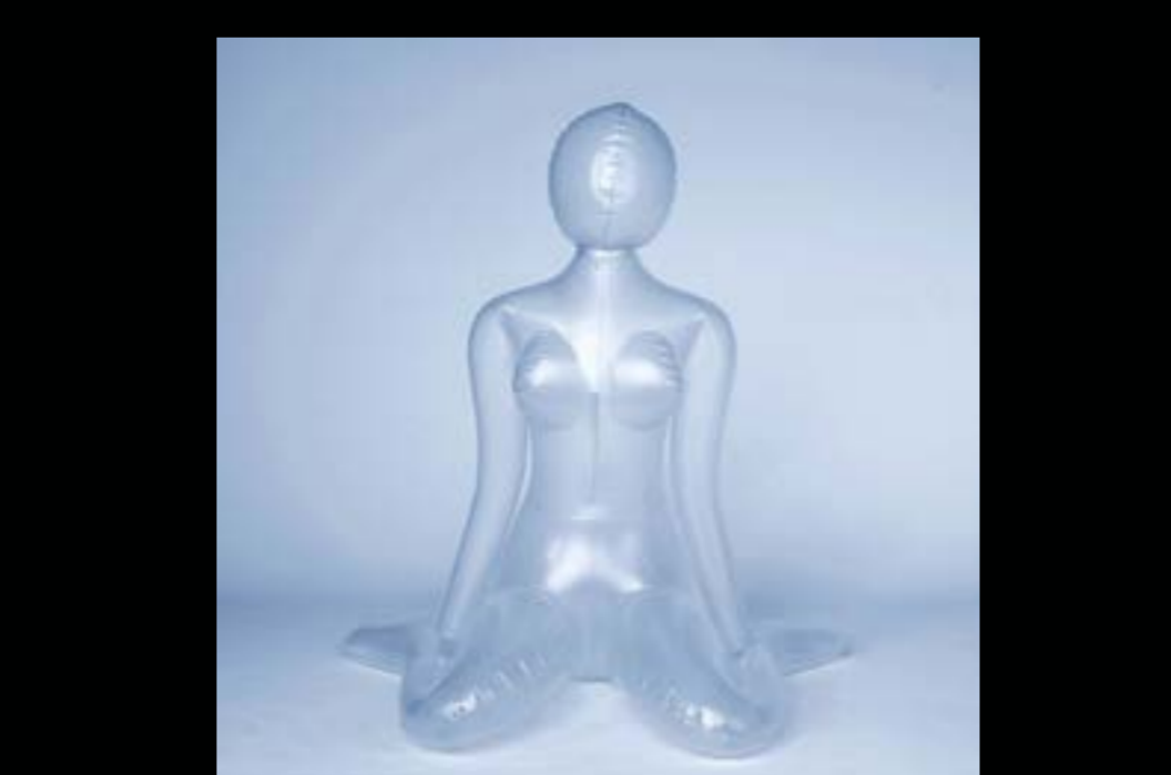
Paradise lost 20,000 thb digital print on organic washi paper 44x44 cm - 2018 - Ed/3