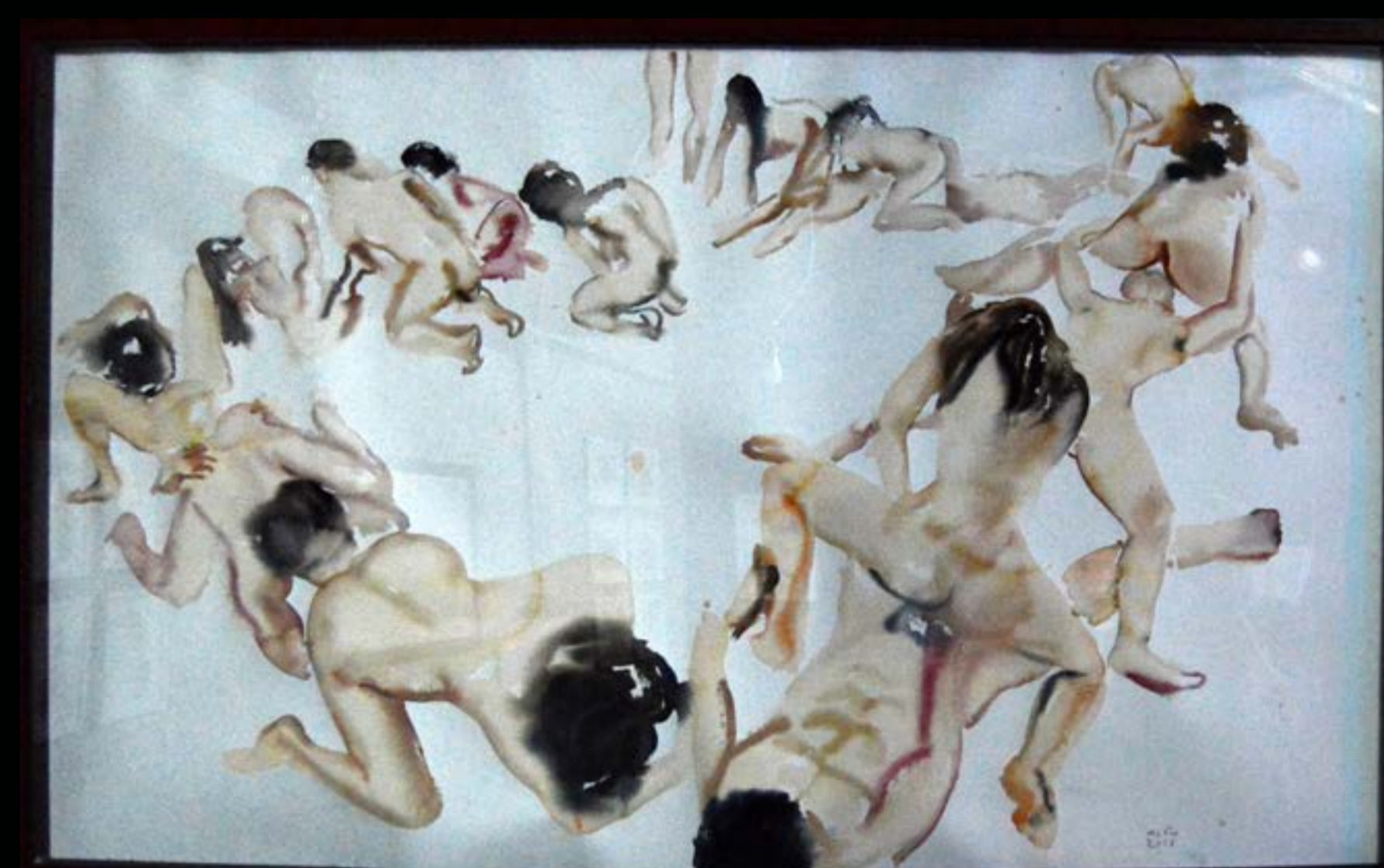
La Danse 160,000 thb Watercolor on paper 162x95 cm - 2018