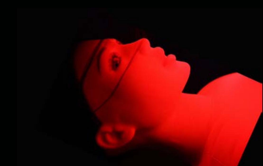
Carmen 10,000 thb digital print on organic washi paper 44x29 cm - 2018 - Ed/3