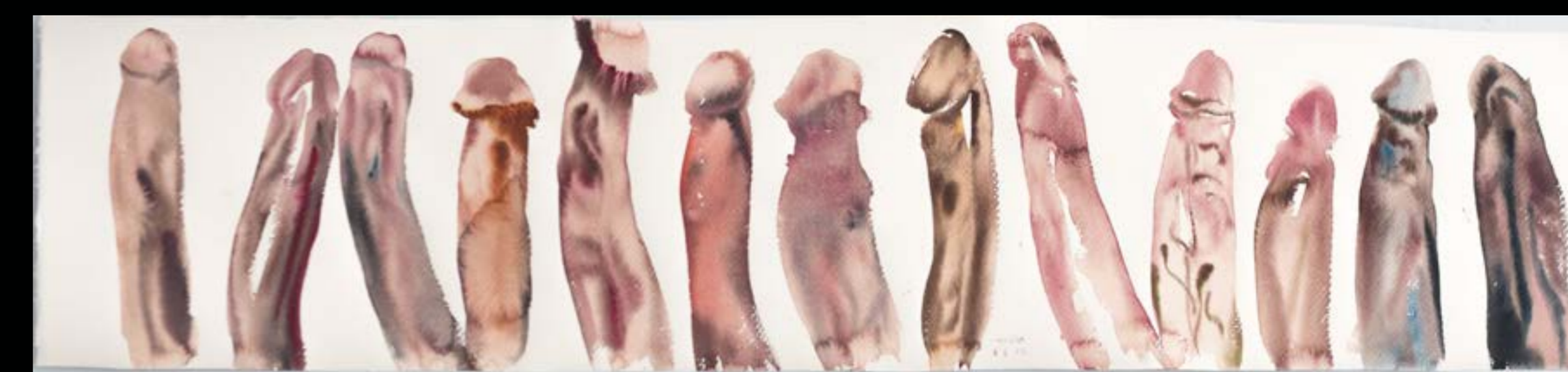
13 48,000 thb Watercolor on paper 29x134 cm - 2017