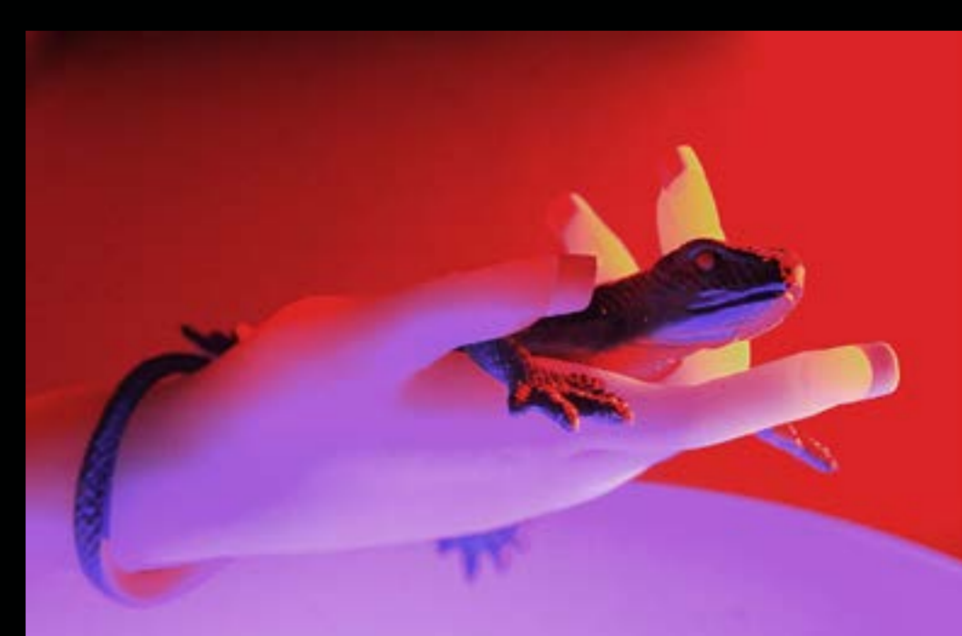
Lizard queen 10,000 thb digital print on organic washi paper 44x29 cm - 2018 - Ed/3