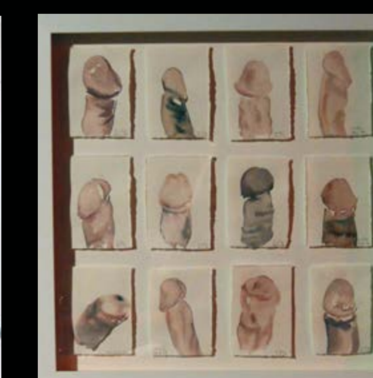
12 28,000 thb Watercolor on paper 47x47 cm - 2018