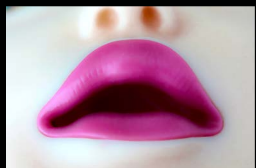
Sabisu 10,000 thb digital print on organic washi paper 44x29 cm - 2018 - Ed/3