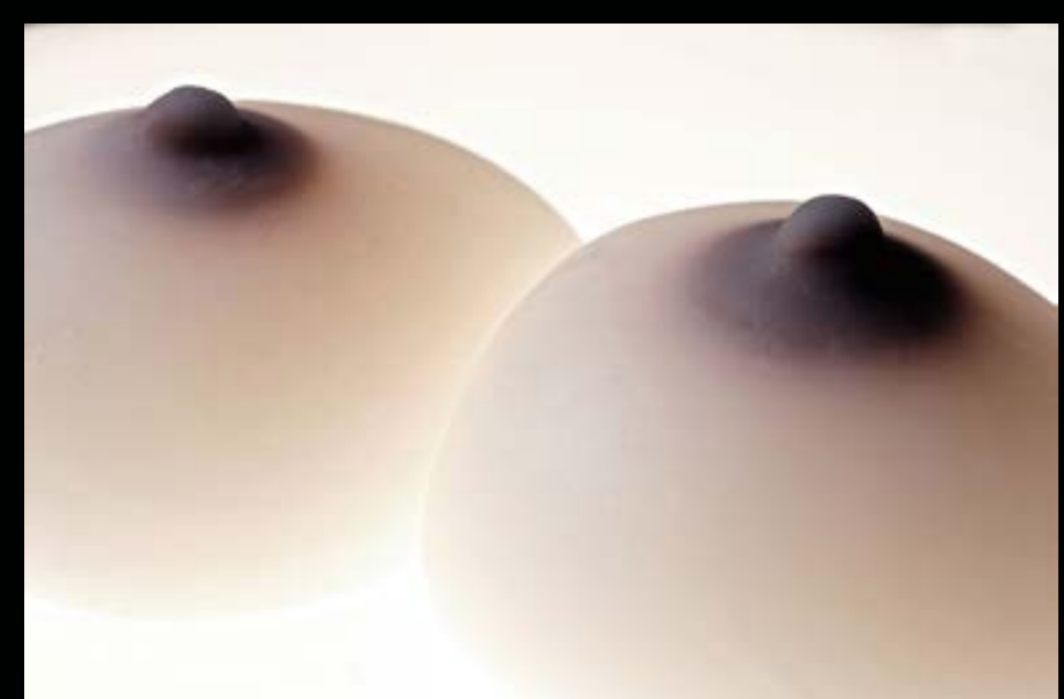
Agathe 10,000 thb digital print on organic washi paper 44x29 cm - 2018 - Ed/3