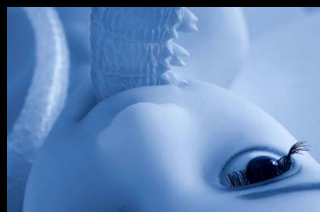
Japonism 10,000 thb digital print on organic washi paper 44x29 cm - 2018 - Ed/3