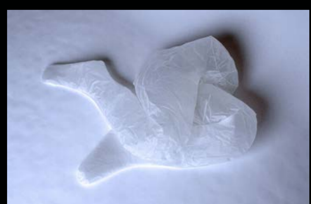
Last breath 20,000 thb digital print on organic washi paper 44x58 cm - 2018 - Ed/3