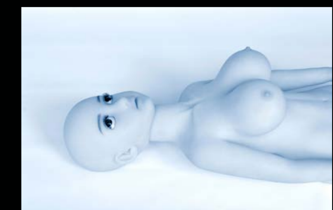
La japonaise bleue 40,000 thb digital print on organic washi paper 88x58 cm - 2018 - Ed/3