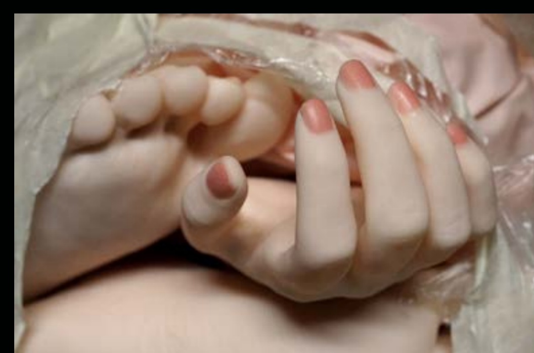
Sic Transit 10,000 thb digital print on organic washi paper 44x29 cm - 2018 - Ed/3