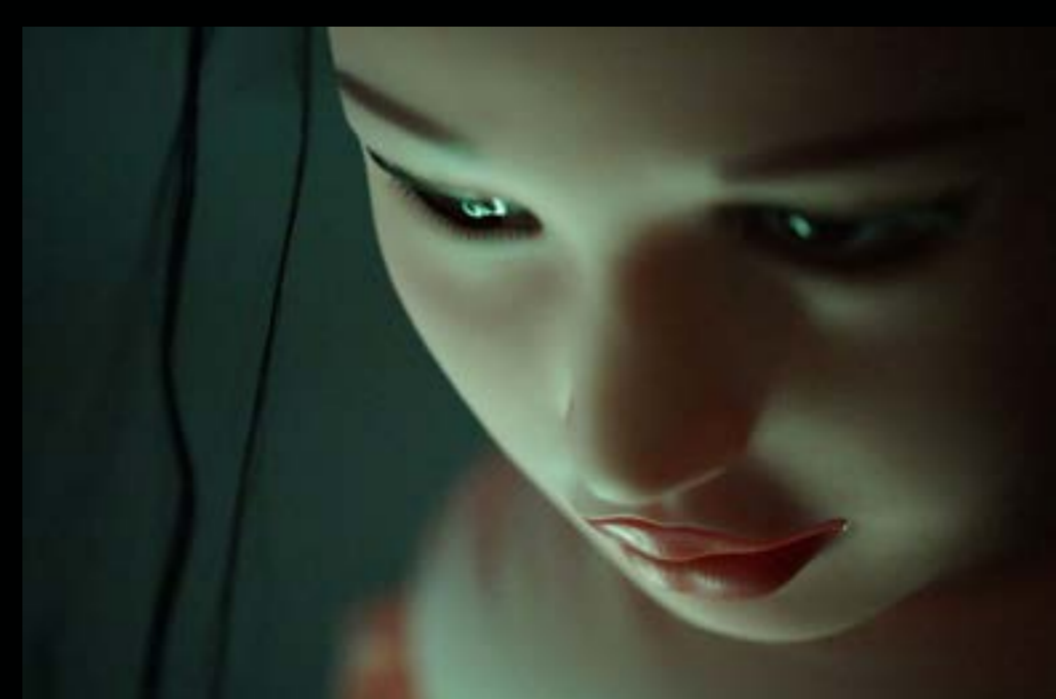
Spirited away 20,000 thb digital print on organic washi paper 44x58 cm - 2018 - Ed/3