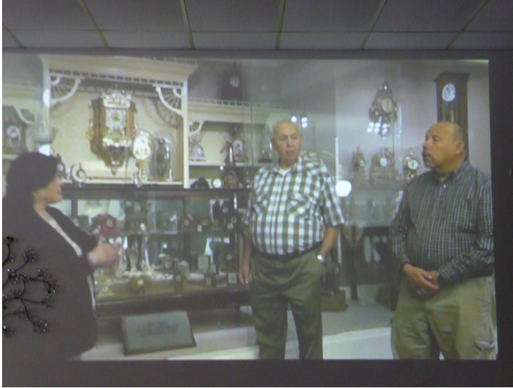
From the video presentation of the West Coast Clock Museum

Only 29 souls braved the impending snow to attend the meeting in Febraury. Nevertheless, trading at the silent auction was brisk! We had an interesting tour of the West Coast Clock Museum's collection. And of course we all had lots of time to kibbutz!