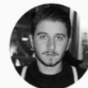
Miguel Agius Graphic Design