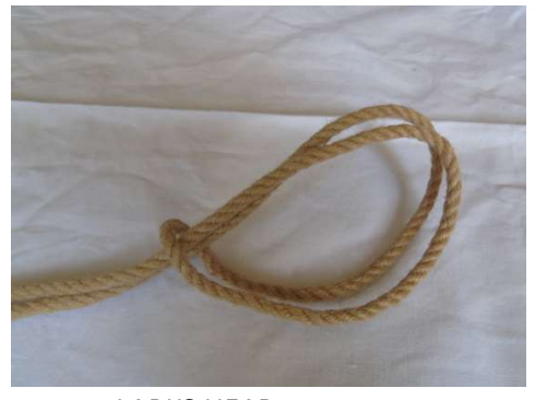
LARKS HEAD A loop through the bite