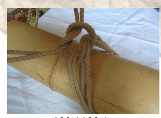
BOOLA BOOLA Single column tie – two wraps, pass bite under – tie a knot