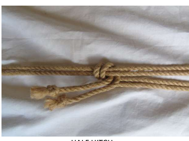
HALF HITCH Over, around and through – double up for lock offs