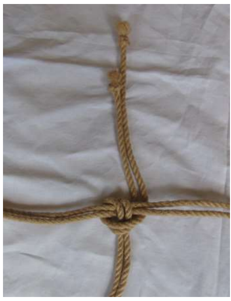
MUNTER HITCH Over-under-over-under – pulls lines together