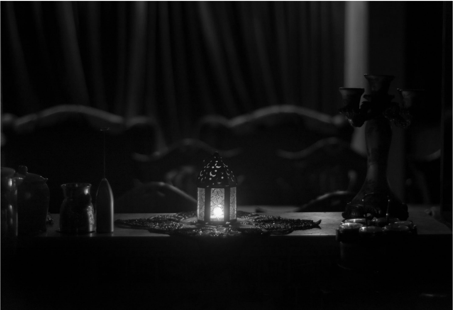
Ramadan is here, and the Brooklyn College Islamic Society and Muslim Women's Education Initiative (MWEI) is providing snacks for Muslims to break their fasts.

stuck on campus during iftar (meal eaten after sunset), the Brooklyn College Islamic Society and Muslim Women’s Education Initiative (MWEI) is providing snacks for Muslims to break their