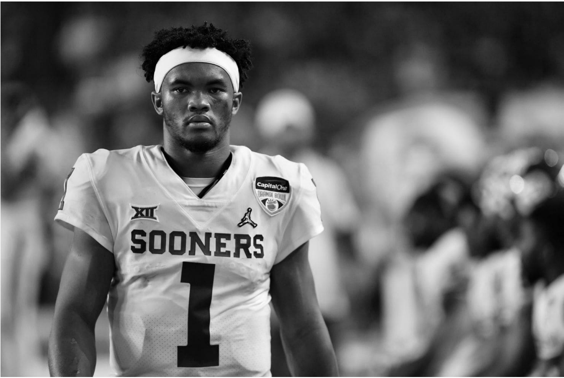
Kyler Murray was the first overall pick in the 2019 NFL Draft.

The Arizona Cardinals selected QB Kyler Murray with the first overall pick. This was a no brainer as he was the best quarterback in the draft and it made sense for both sides. Murray, the reigning Heisman Trophy winner, will be under the tutelage of a head coach Kliff Kingsbury who