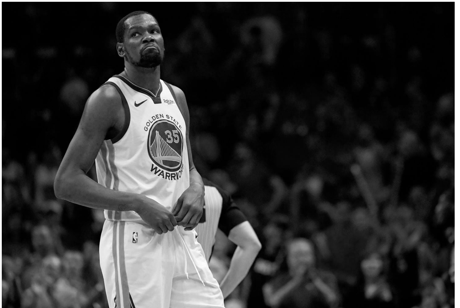
Come this summer, Kevin Durant will have a big decision to make in free agency.

As the years went by after Durant's decision, it seems all may be forgiven between the two superstars. Westbrook and Durant seem to be on good terms as they showed supporting gestures of handshakes and hugs after their games. Durant described their relationship to be "all love." Durant has always been linked to the Thunder and was even present at Nick Collison's