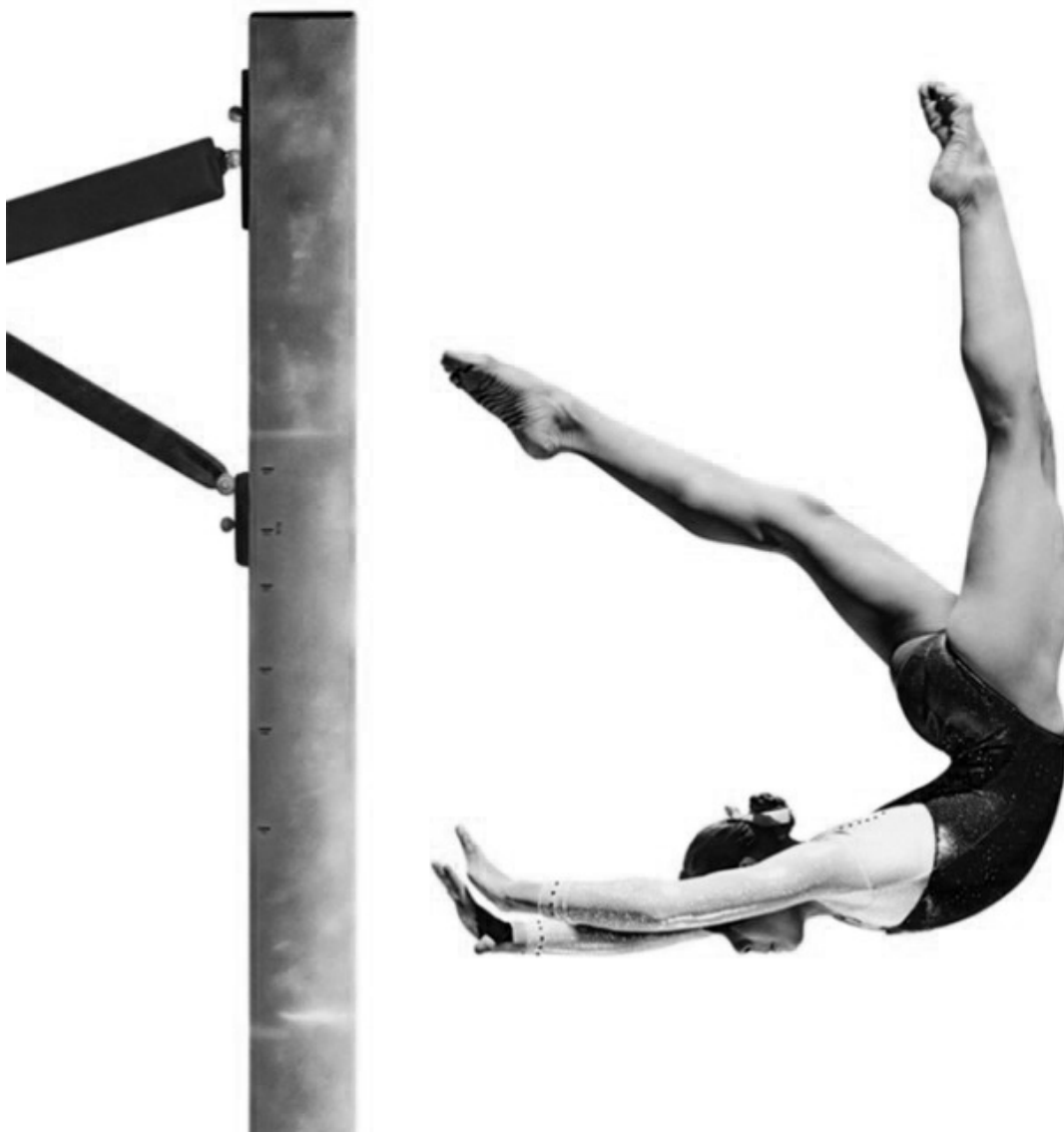
"At the Heart of Gold" is a documentary about the victims of Larry Nassar.

Maroney was not featured in this documentary, but similar stories were told.