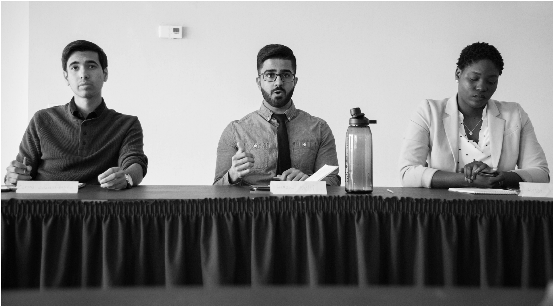
An investigation for the USG president elect is moving forward. A hearing will take place on Tuesday.