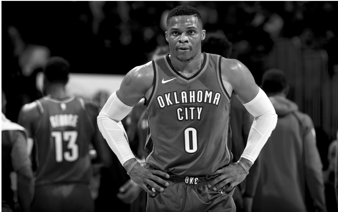
In 2016, Kevin Durant left teammate Russell Westbrook (pictured above) to join the Golden State Warriors.

Durant may possibly be interested in rejoining the team that drafted and molded him at some point in his career but the odds seem low due to OKC's lack of cap flexibility. But from history, we have learned that the NBA is unpredictable and a scenario such as this doesn't sound too far-fetched.