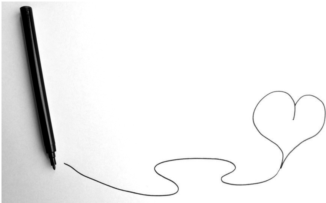
My girlfriend had some ideas for stories I should write for this column.

As a comedian and writer, I have friends and family constantly asking me (or telling me) to put their jokes, stories, and observations into my work. It is incredibly frustrating and I am tired of being an outlet for bits and gags and long-winded tales. That being said, my girlfriend had some ideas for stories I should write for this column. And since she can give things my family and friends can't and shouldn't... I had to give in. So here are my retellings of her HILARIOUS stories that she INSISTED I put in this submission. My girlfriend and her friend went to the store the other day and when she got there, she had realized