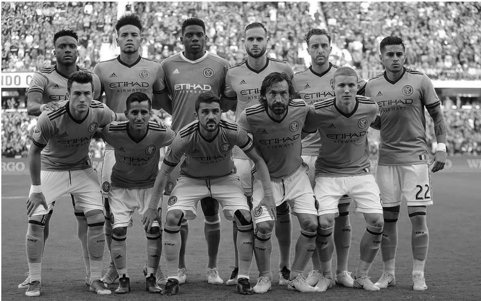
Local MLS teams such as the New York City FC (pictured above) will try to add on to their success.

Local teams such as the New York City FC that play in Yankee Stadium in the Bronx, and New York Red Bulls who play in Red Bull Arena in the outskirts of Newark, will try to add on to their successes from the last couple of seasons. New York City FC placed 3rd place in the Eastern Conference in 2018, while their cross-town rivals NY Red Bull’s topped the Eastern Conference and also finished with the best regular season record in the league. Both New York teams made deep runs in the playoffs but got eliminated to the eventual champions Atlanta United. New York City FC started their 2019 season with an away 2-2 draw to Orlando City SC on March 2nd, who in the off-season signed Portuguese star Nani. The New York City FC hopes to repeat