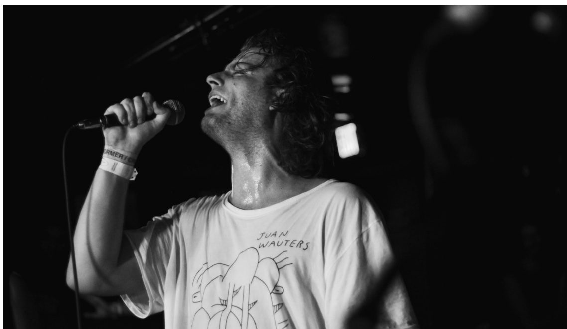
Mac DeMarco recently announced his next album.

The slow sad ballad is accompanied by a strange and oddly comical music video of Mac DeMarco dressed as a "creature" in a cowboy hat and bathrobe. The release of the track was quickly met with controversy from Mitski fans who claim that DeMarco is stealing from Mitski, who in 2018 released her album "Be the Cowboy" with a featured single also entitled "Nobody." Despite the shared title however, the tracks have no similarities to each other, neither musically or thematically. DeMarco is planning a tour surrounding the release of his new album and will be performing in Prospect Park, Brooklyn, on August 6th.