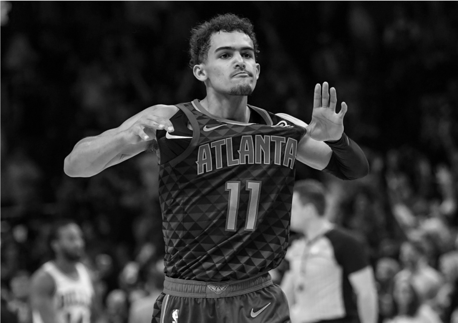
Trae Young was off to a rough start at the beginning of the season but recently found his way and is pushing more of his case for Rookie of the Year.

Every point guard struggles and needs time to get better, for example, D’Angelo Russell, Kyle Lowry, Mike Conley, Stephen Curry, Goran Dragić, Steve Nash, all these players went through a drought in their careers but was able to improve