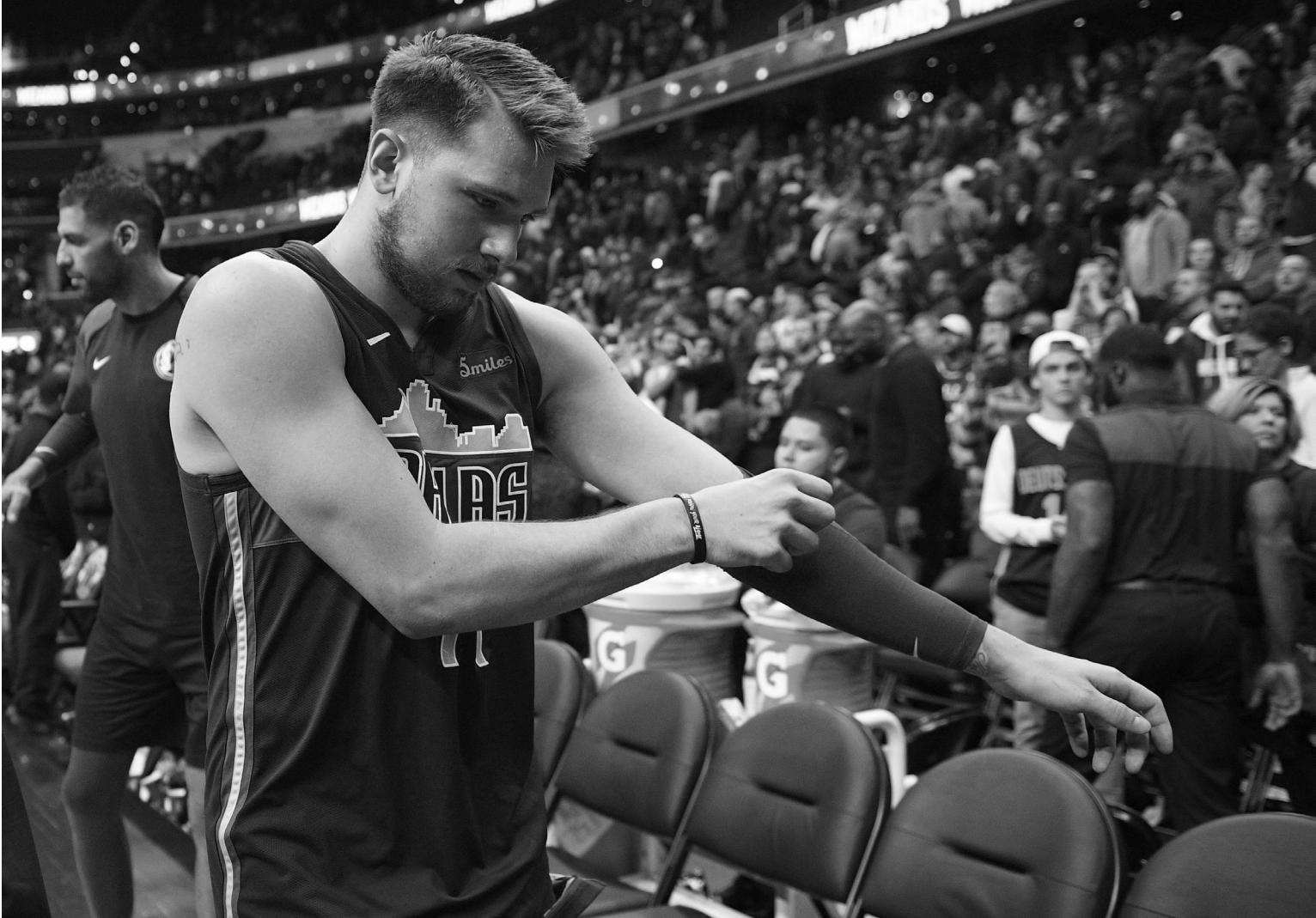
Trae Young was quickly labeled a “bust” as the player he was traded for in the draft, Luka Dončić (pictured above), was already putting the league on notice with his efficient play for the Mavericks.

The Luka-Trae battle will be fought for years and years. Two players who were drafted for each other on draft night is a story many NBA fans will be following beyond this season. Maybe one day they will compete at the highest level in the NBA Finals.