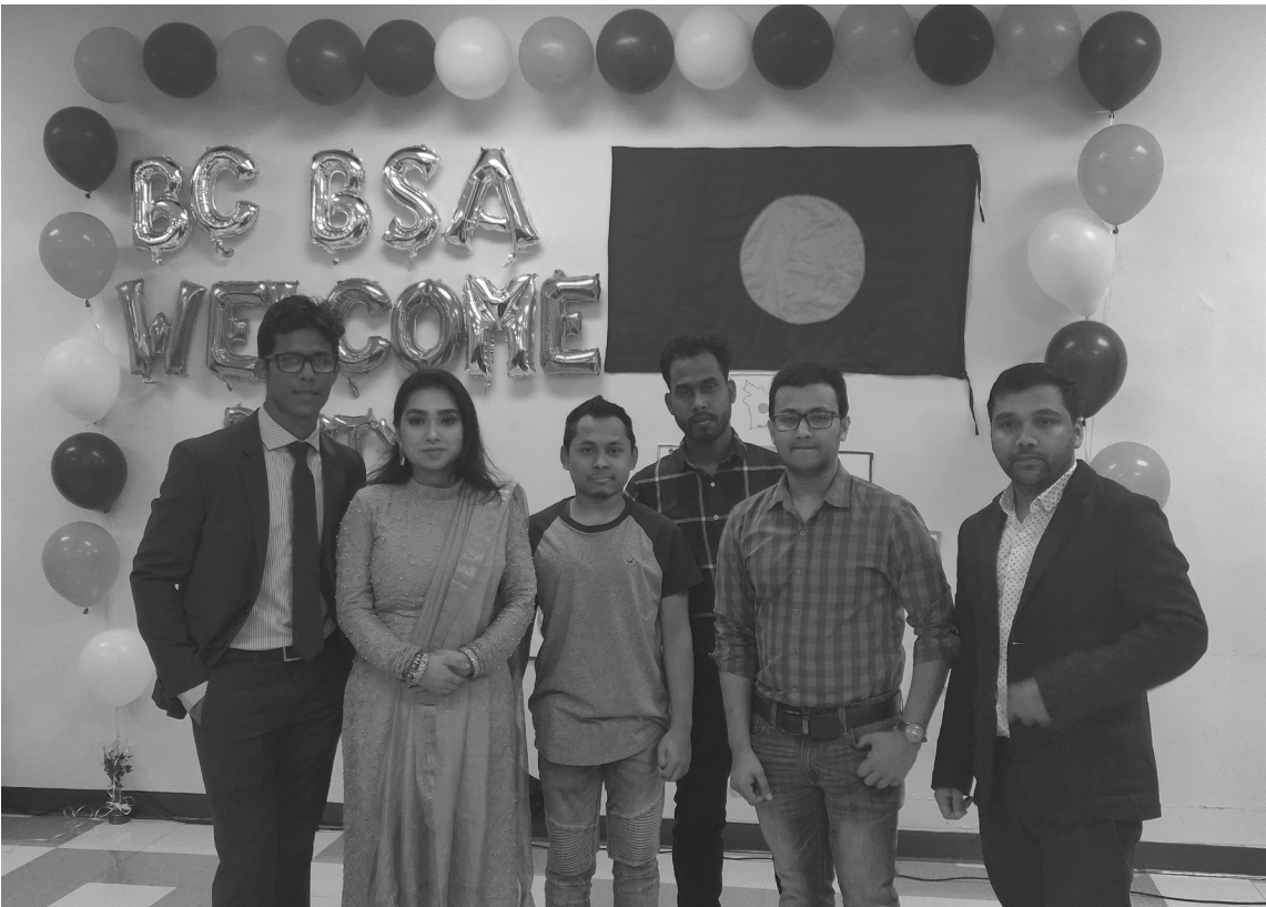
Board members of the Brooklyn College Bangladesh Students Association kicked off the club’s launch with a welcome party.