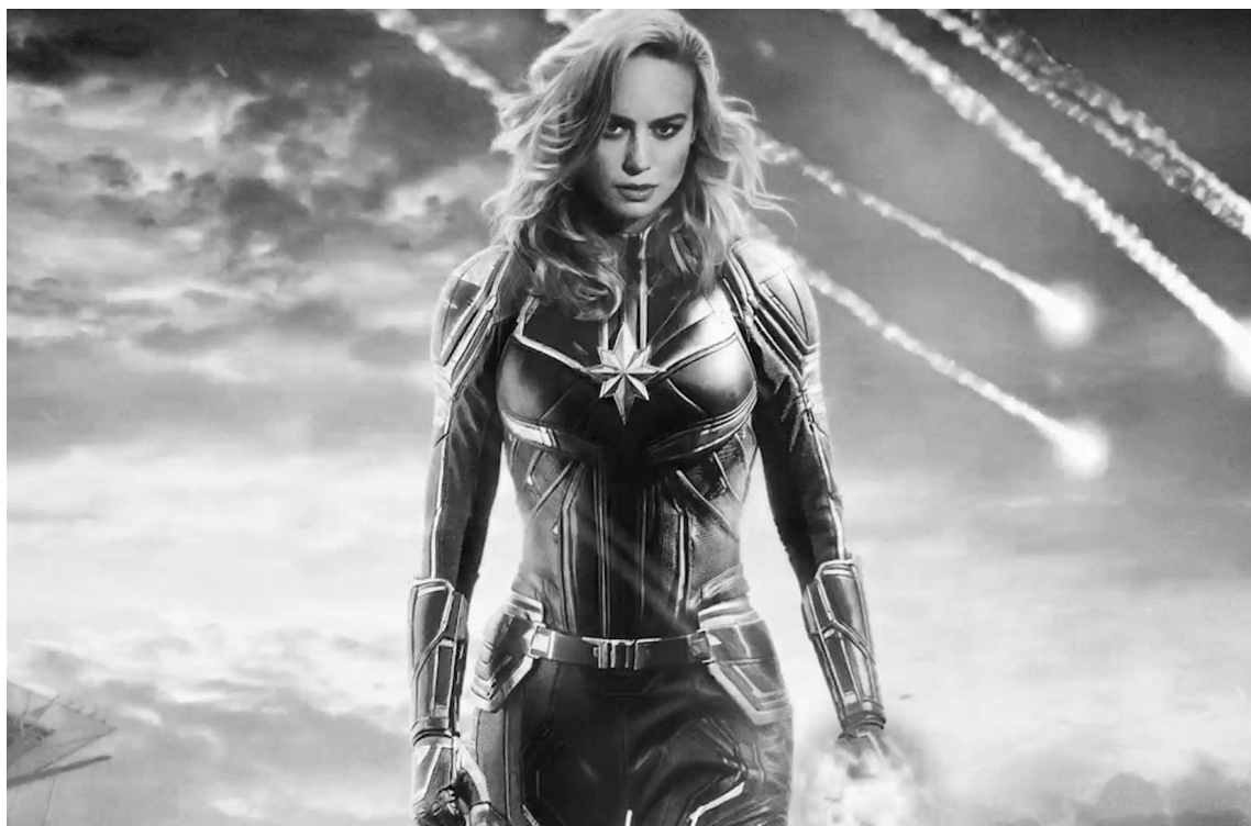
Captain Marvel mirrors another recent Disney film, Bumble Bee.

Throughout this drive down memory lane, we