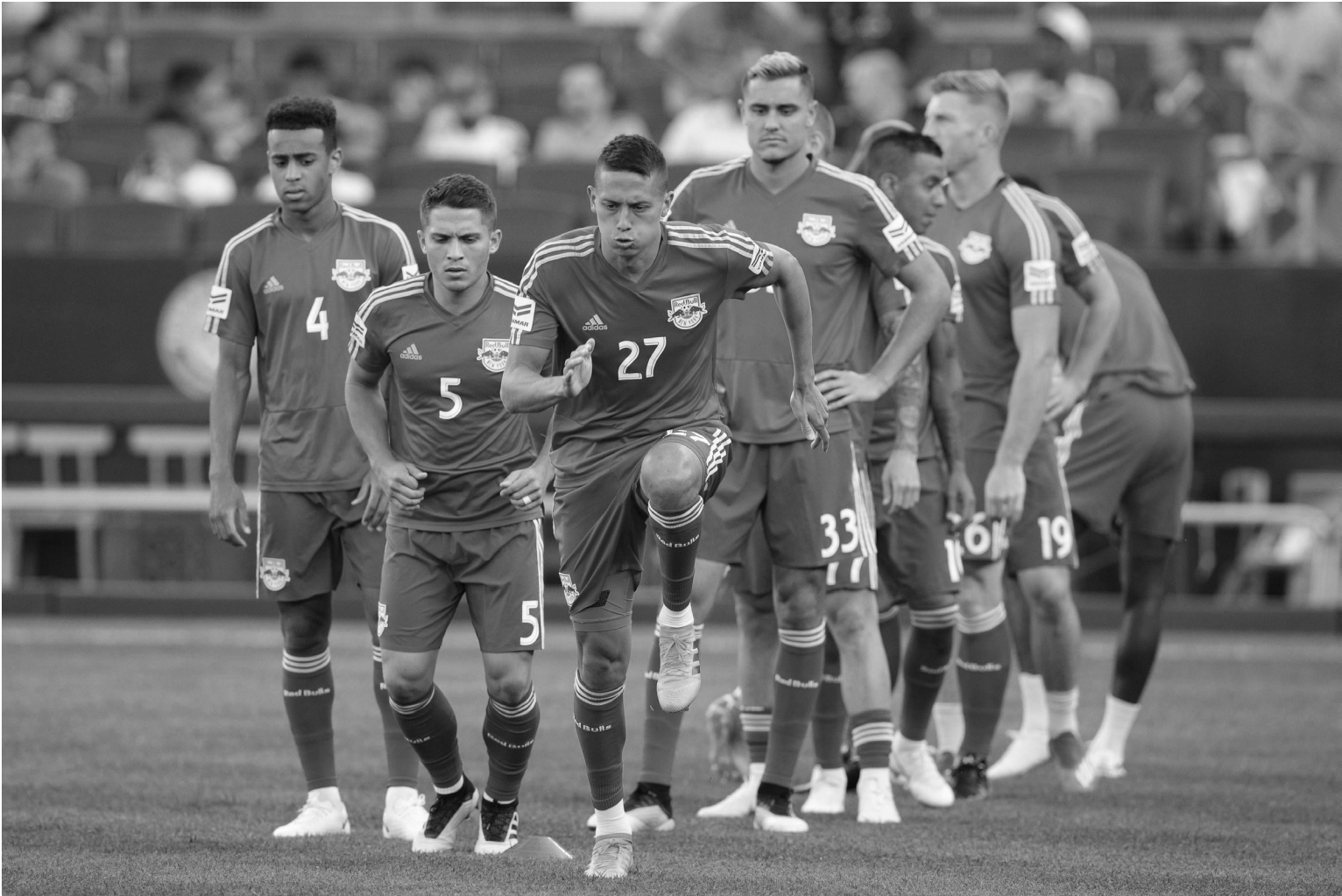
The New York Red Bulls (pictured above) topped the Eastern Conference in 2018.

lyst for their championship run last year. They hope to repeat the same in 2019, as over the off-season, former MVP Josef Martinez signed a new multi-year contract deal. The same player who scored 34 goals in 34 games setting a new record for most goals in an MLS Season. His success in the playoffs earned him the MLS Cup MVP credential, after scoring one of the goals that brought Atlanta’s sports championship drought to an end. Many more teams around the Eastern and Western Conference hope to make a run for the MLS Cup in 2019. The likes of LA Galaxy who are being led by Zlatan Ibrahimovic, DC United with Wayne Rooney, 2018 Western Conference champions Portland Timbers, along with other consistent performers like the Seattle Sounders, Sporting Kansas City, Los Angeles Football Club, and Toronto FC; bring talent on the field and remarkable support in the stands encapsulated in some of the most state of the art stadiums the sport has to offer in America. The 2019 MLS season can be kept up to date on ESPN and FOX Sports 1 from March until November. MLS can also be kept up to date by attending local venues at the Yankee Stadium and Red Bull Arena on match days.