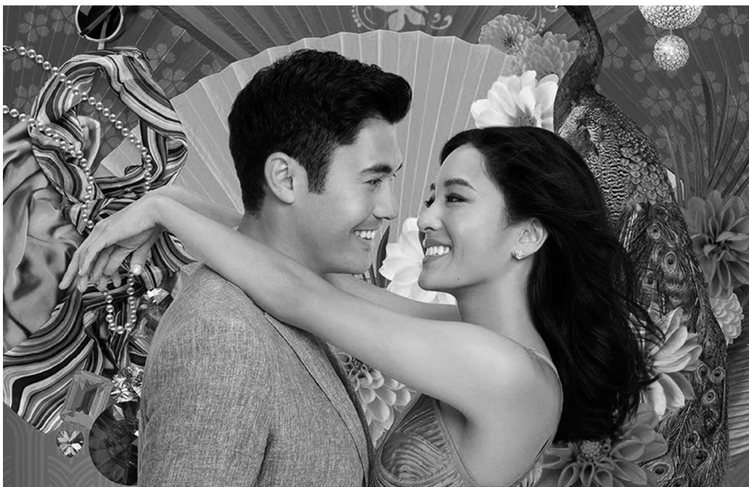
“Crazy Rich Asians” makes a statement by showcasing Asian-American actors on the big screen.

The storyline has rich themes and a depth not usually seen in the typical rom-com, ana-