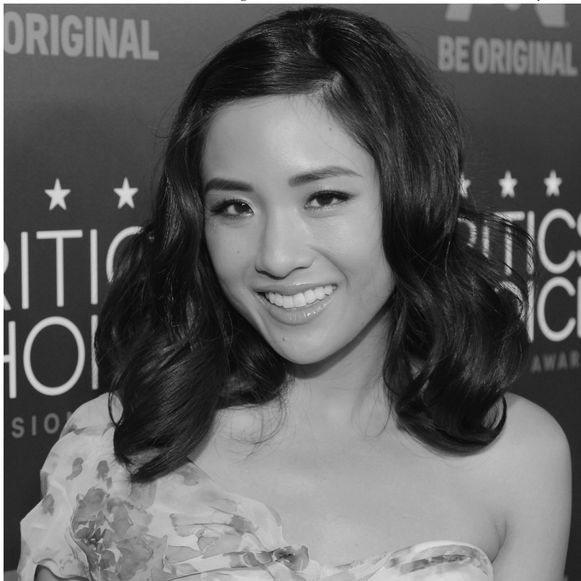
Constance Wu starred as Rachel Chu in “Crazy Rich Asians.”

However, as of September 5, “Crazy Rich Asians” broke box office records and, according to Box Office Mojo, surpassed $100 million, bringing in a total of over $121 million domestically and $22.7 million in foreign markets. The film does not simply rely on its on-screen Asian representation to carry it through the charts; the ethnic diversity is just an added bonus to an excellent movie.