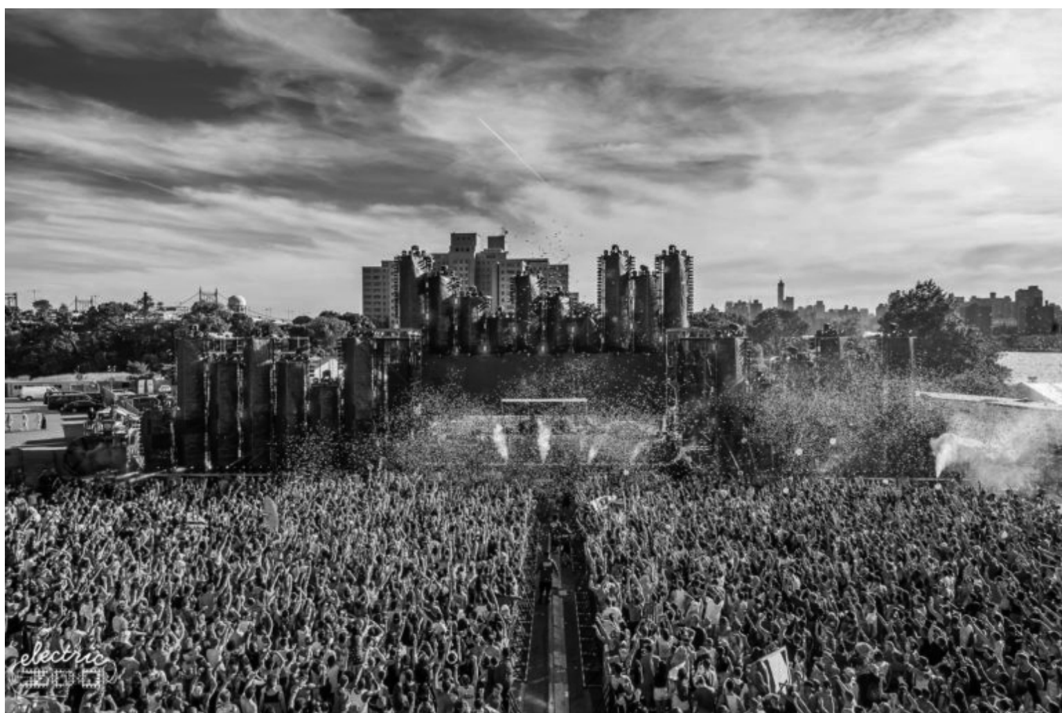
Electric Zoo was the perfect marker to end the summer of 2018.

The setup of EZOO was the same as every year: 4 water refill stations, a fort of portable potties, medical and information tents, and neat arrays of snack shops. One special thing about EZOO was its system of handling monetary transactions. All purchases can only be made through a wristband. It reminded me of the same paying method the social media conglomerate WeChat utilizes. With a barcode, a scanner, and enough money in the bank, you can conveniently purchase anything. This is how EZOO's paying method works: before entering the island, party-goers are supposed to activate their wristbands and "top off" (load up/refill) the amount of money they want in the wristband. They offer options such as auto-refill, which automatically refills