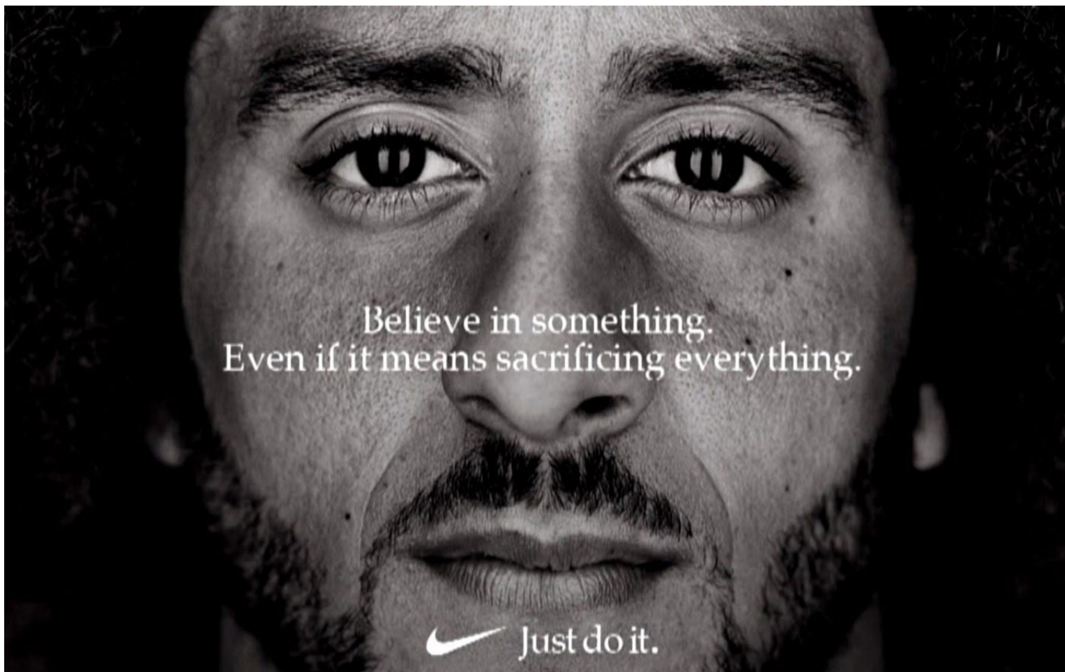
The new Nike ad was met with controversy including people burning their shoes and ripping the Nike logo from their socks.

Kaepernick is no stranger to controversy or outrage on social media. In August of 2016, Kaepernick kneeled during the national anthem before an NFL preseason game, two years later, the NFL enacted a policy banning that act. Though Kaepernick is not the only athlete featured in this campaign (others include Serena Williams, and Odell Beckham JR), it was Kaepernicks’ presence that seems to have parked a negative reaction towards the company. All over social media, those who do not agree with the company’s decision could be seen posting videos and pic-