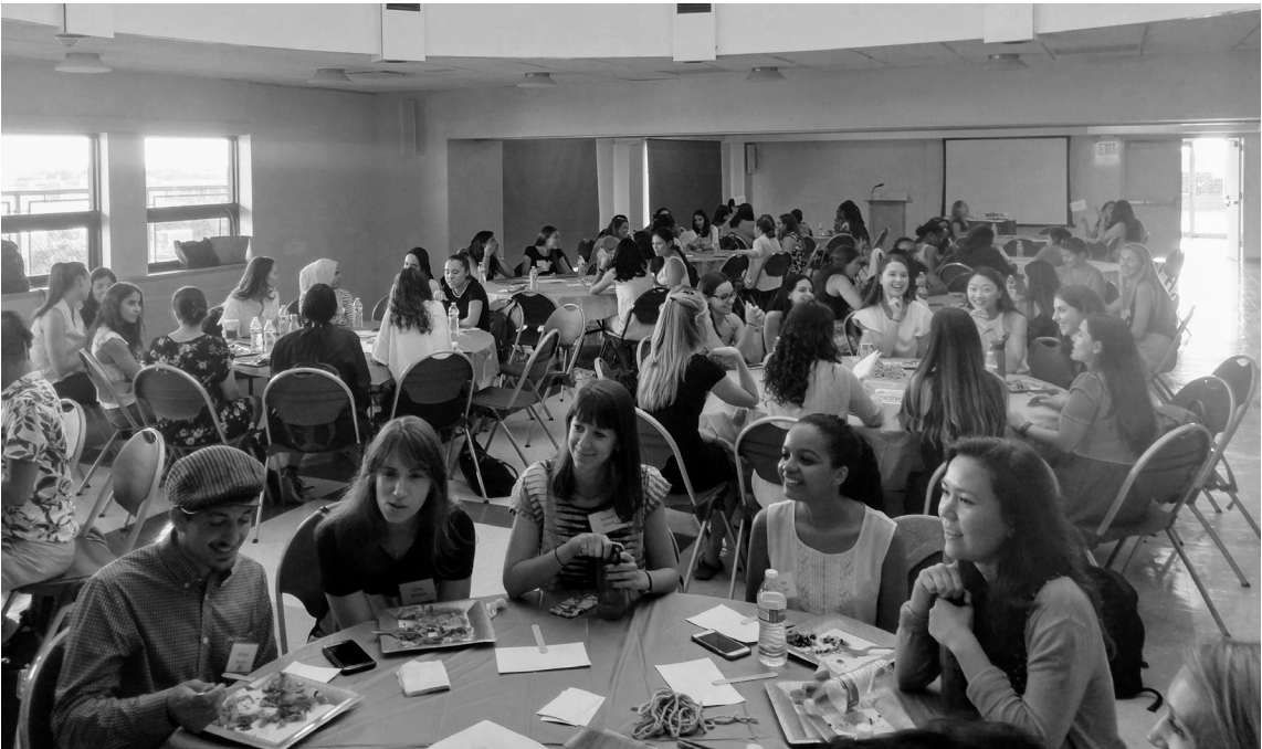
Last week marked the BC Speech Language Pathology Center’s annual meet and greet where graduate students ate pizza and spoke about SLP.