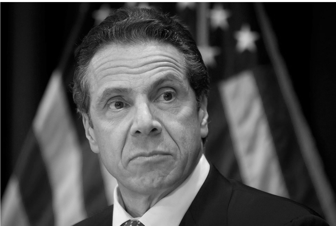
Governor Cuomo is facing a tough contendor. Will he finally work to fix CUNY facilities?

the only path to economic or civic success, but it helps. Despite the obvious benefits from public investments, New York has been shifting the costs of attending college from the state to students and their families. The result has been dramatic: over 44 million Americans collectively hold nearly $1.5 trillion in student debt. That means that roughly one in four American adults are paying off student loans. When they graduate, the average student loan borrower has over $37,000 in student loan debts, a $20,000 increase from 13 years ago. Much hand wringing has occurred over this trend, but not much action. Here in New York, Governor Cuomo has successfully advanced a proposal to make