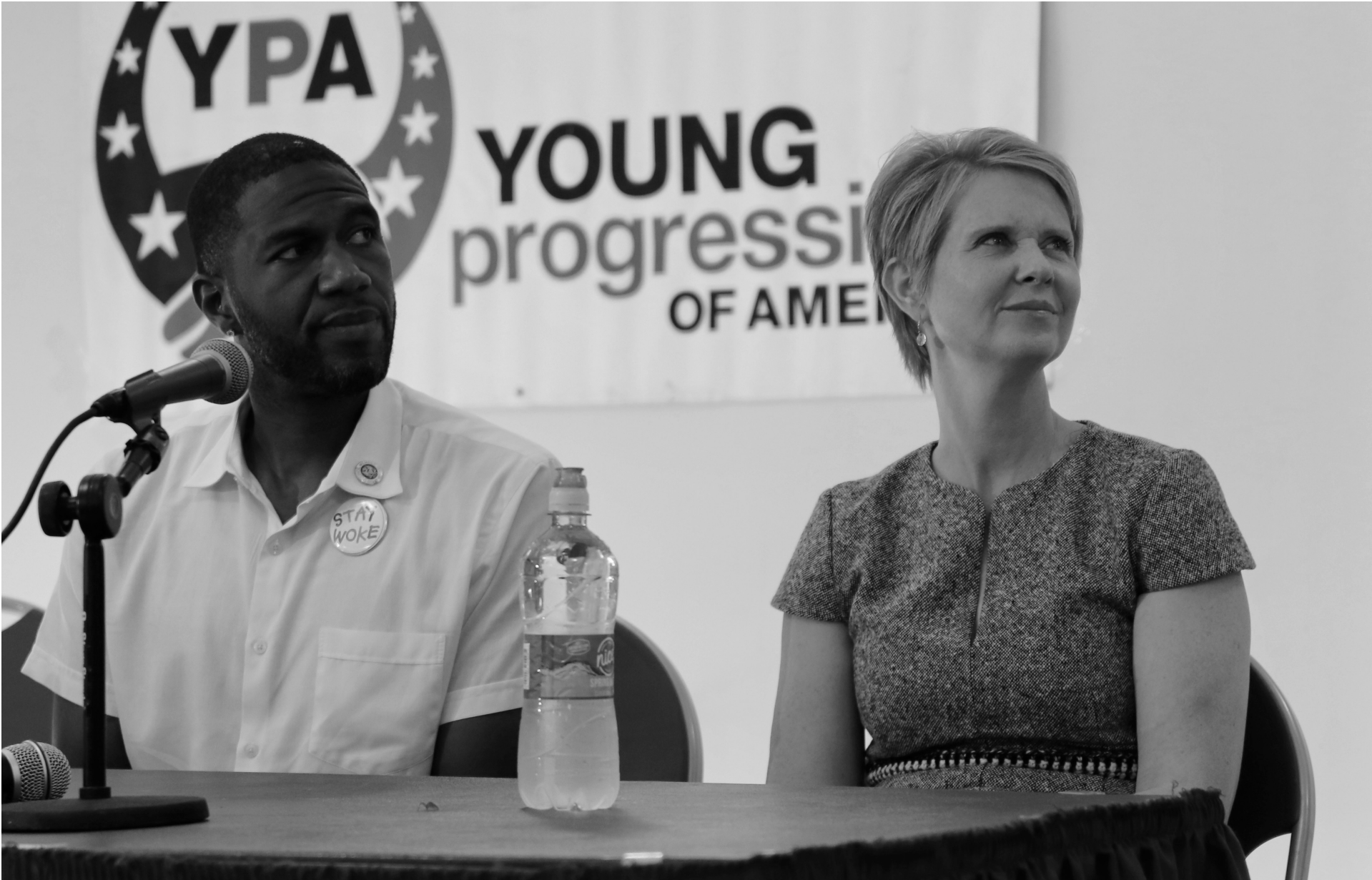
Jumaane Williams and Cynthia Nixon spoke to Brooklyn College students and staff about their visions for New York.