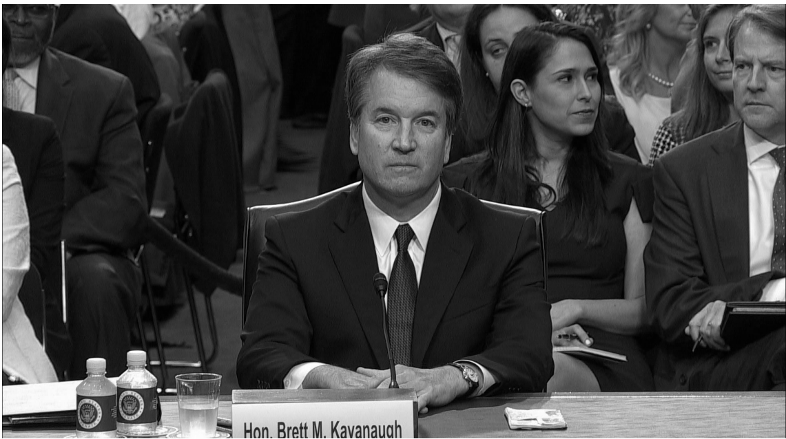
Supreme Court Justice nominee Brett Kavanaugh is a Republican with a long record of hostility towards abortion, gun safety, and net neutrality.

Kavanaugh is a staunch right-wing judge with a long record of hostility towards abortion and contraception rights, gun safety laws, net neutrality and many other issues. This spells danger for rights that many have come to view as secured, such as gay marriage (Kennedy had sided with the liberal wing of the court in the Obergefell decision that legalized gay marriage across the country in 2015), abortion rights and workers' rights as well as several that remain undecided or hanging in the balance. A reliable 5th conservative vote in Kavanaugh would allow the Court