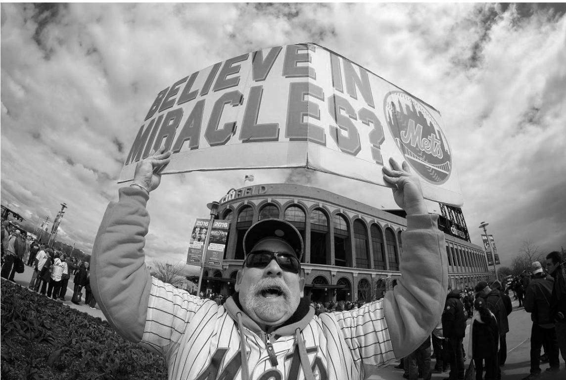
The Mets may be in store for a hefty package of prospects, and maybe, just maybe, things will start to trend in the right direction for the Mets.

As the team's performance worsened over the course of this year, the Mets traded some familiar faces. Fan-favorite, 29-year-old Matt Harvey, was traded to the Cincinnati Reds. Jeurys Familia was traded to the Oakland Athletics for what many would consider too little. And Asdrubal Cabrera, who had 18 home runs and 58 runs batted in during the first half of the sea-