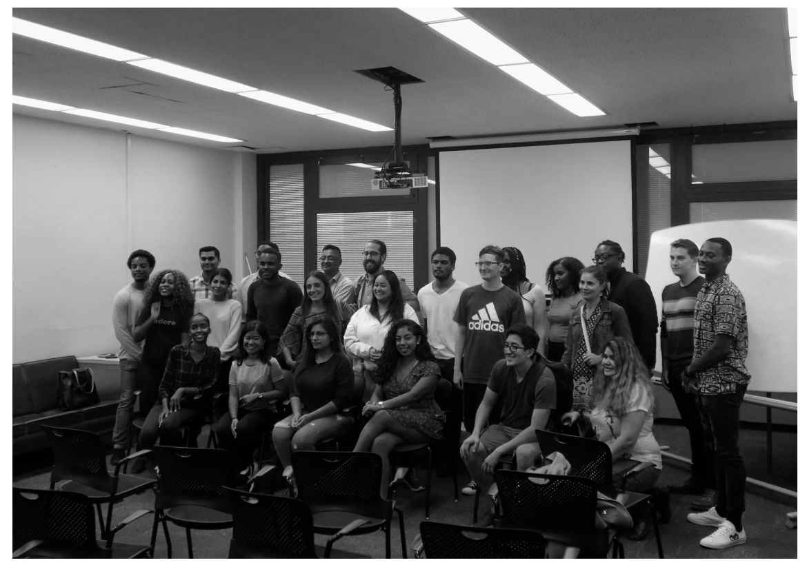
GIOP students take a photo after an hour's worth of camaraderie build up.

Naturally, the analytically-based path career