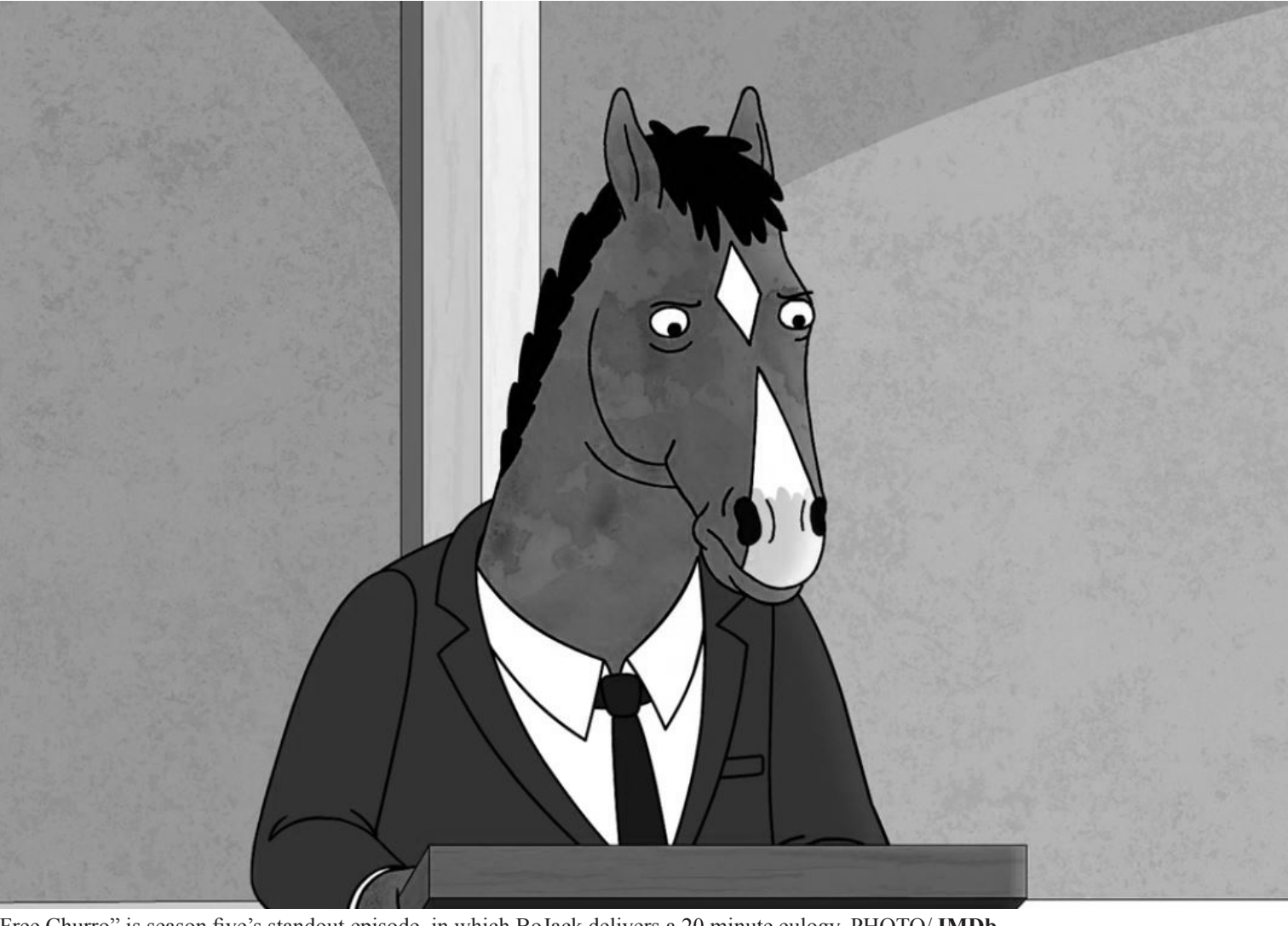
"Free Churro" is season five's standout episode, in which BoJack delivers a 20 minute eulogy.

ly relevant to the #MeToo movement. BoJack assaults his female co-star during a stunt gone wrong. Although it was an accident and BoJack was high, the writers make it clear that that doesn't matter. Instead, BoJack needs to apologize and take full responsibility for what he has done. It sends the message that the circumstances do not matter when you have hurt someone - you still need to accept responsibility. This sends the right message about sexual