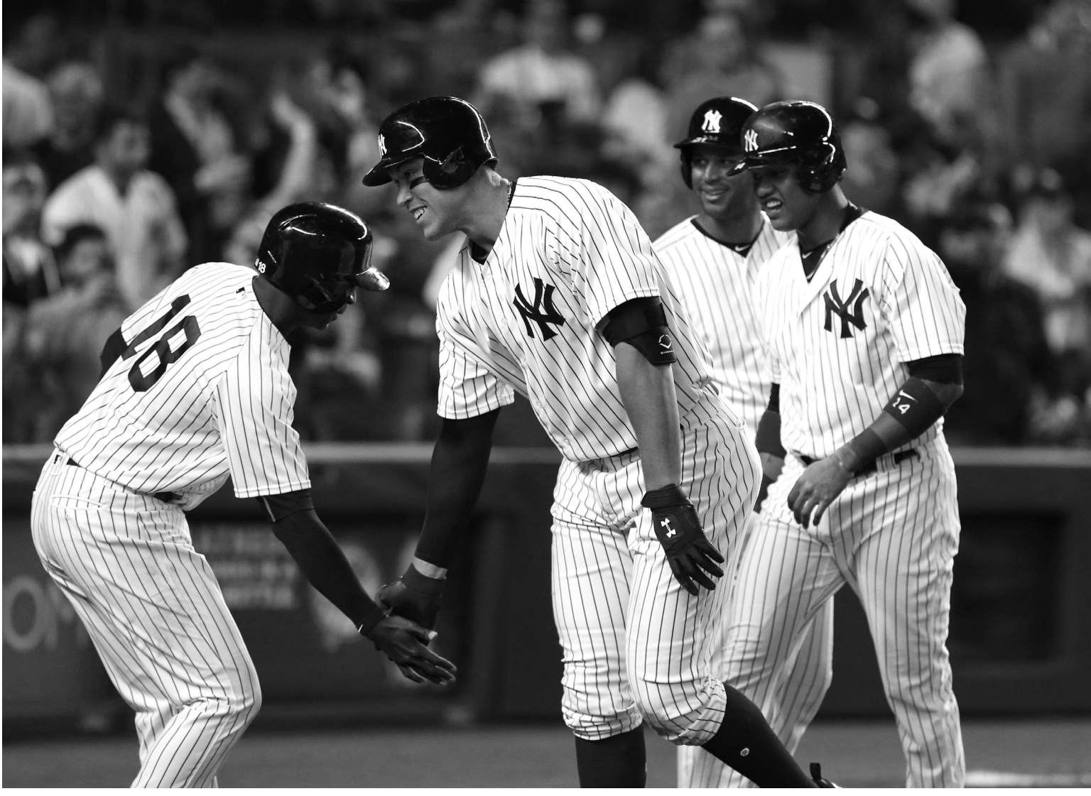
The Yankees will need to be firing on all cylinders to win their wildcard game.

The Athletics have also faced trials regarding injury. Star left-handed pitcher Sean Manaea was shut down for the remainder of