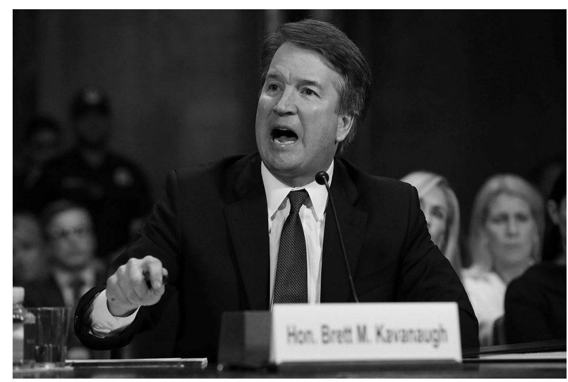
Brett Kavanugh should not be appointed as a Supreme Court Justice.

The contrast between Dr. Ford and Kavanaugh's performance was striking. She calmly and gracefully answered the questions posed to her by both Democrats and the female sex crimes prosecutor that the Republicans on the Judiciary Committee had hired to avoid the optics of a group of older white men aggressively grilling a woman under duress. She attempted to answer every question posed