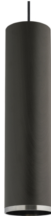
Weathered Gray Oak