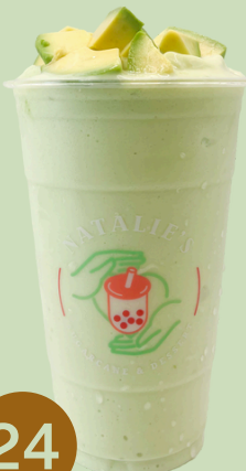
24 AVOCADO (Smashed) (Smoothie)