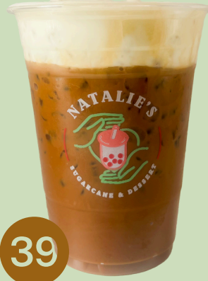
39 SEA SALT