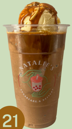
21 COFFEE SMOOTHIE