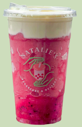
CREAMY STRAWBERRY DRAGON FRUIT