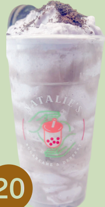
20 TARO OREO