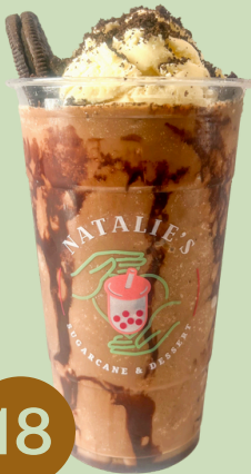
18 OREO CHOCOLATE