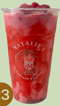
23 DRAGON FRUIT