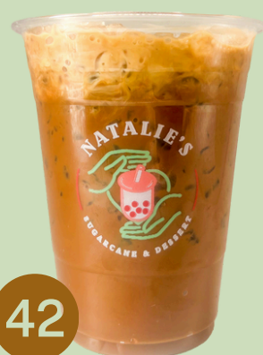
42 VIETNAMESE COFFEE