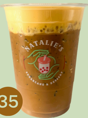
35 EGG COFFEE