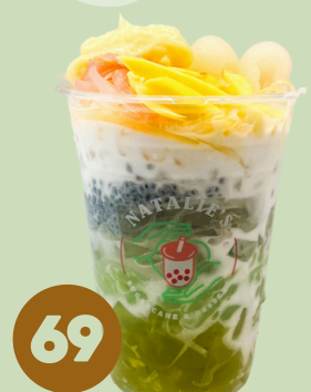
MT. RAINIER SƯƠNG SÁO BÁNH LỘT Pandan cendol, Grass jelly