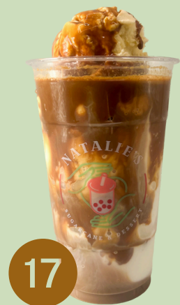
17 COCONUT COFFEE