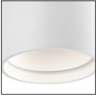
WH - White