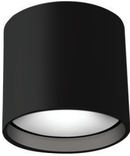
BK - Black