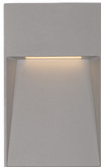
GY - Grey