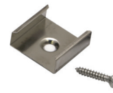
mounting clip & screw

The Naro models of Continua Channels are designed for recessing into wood, cabinetry, and indoor materials and provide an excellent heat sink to cool and prolong the life of LED tape light. Naro 1 is Alloy LED's most low-profile recessed channel and features a lip on each side of the channel for a clean installation. Can be configured for installation in wet locations using dry location LED tape light.