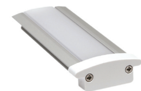
shown with closed end cap