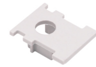
open plastic end cap

Duro™ models are designed for in-ground locations with foot traffic, but NOT recommended for locations with automobile traffic. With thick, durable sides, base and diffuser cover, the Duro 1 is the ultimate solution for high-quality LED lighting in harsh dry and wet conditions. When used with any of Alloy LED's Wet Location LED Tape Lights, the Duro 1 is a fully waterproof and weatherproof lighting solution.