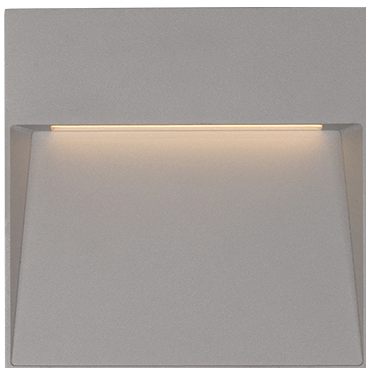
GY - Grey