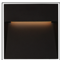
BK - Black