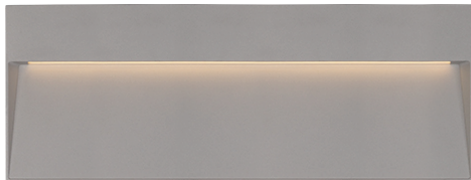
GY - Grey