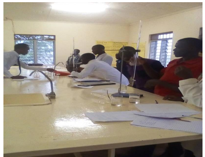
Science students in a practical session