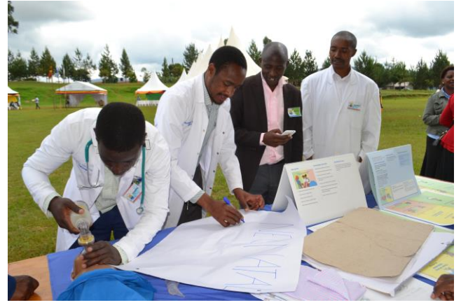
Students of Medicine and Surgery discussing resuscitation with one of their Tutors