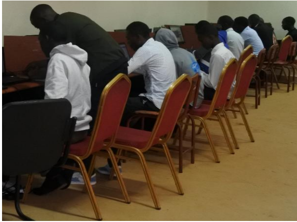
Students in one of the Computer Labs