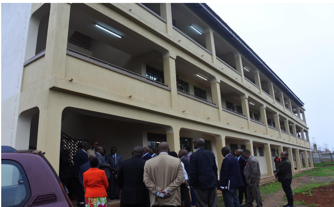
The recently completed General Lecture Hall Building