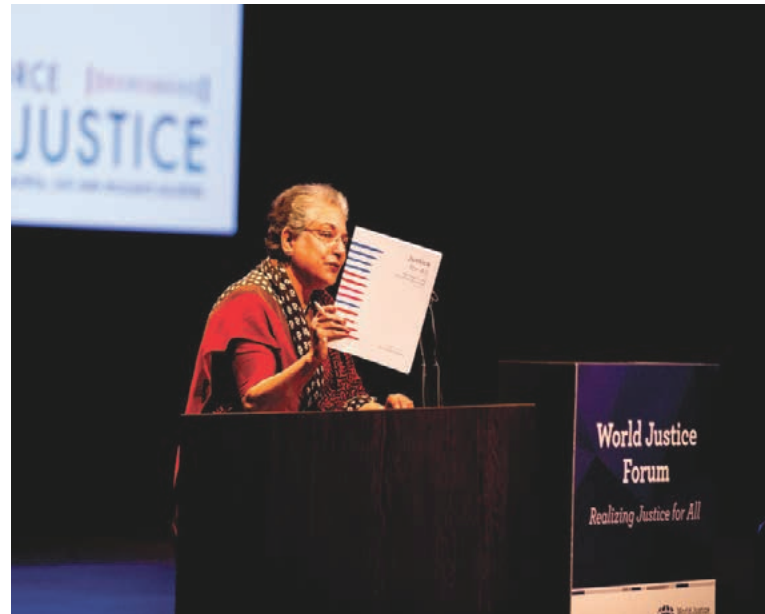
Above: Hina Jilani of the Elders, co-chair of the Task Force on Justice, addresses the World Justice Forum in The Hague in April 2019 (Photo: Bart Hoogveld).

Force's research through data analysis, policy commentary, and reviews of available evidence, resulting in multiple reports and working papers that form the basis for future action. This alliance—and the support of justice leaders and activists around the world—will provide the basis of a new phase of Pathfinders' work on justice.