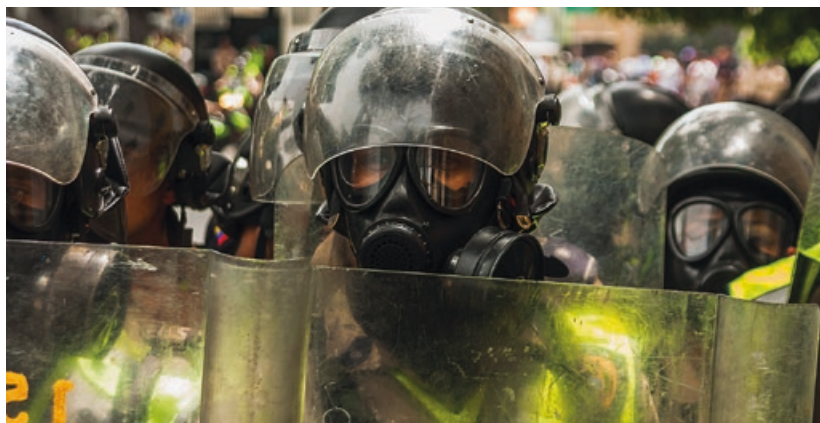
In Caracas, Venezuela, the police block the pace of a demonstration.

in Latin America, are as high as in many war zones. Beyond the human impact, this poses political challenges. Gangs displace governments and offer a form of security and justice to the communities they control. 14 The resulting violence is contagious in three ways. Most immediately, it “follows an epidemic-like process of social contagion” as it spreads through social networks. 15 More broadly, it undermines a society’s resilience, as institutions and politicians are corrupted and implicated. 16 And over the longer-term, cycles of violence are perpetuated, as children are raised to believe that violence is normal or inevitable.