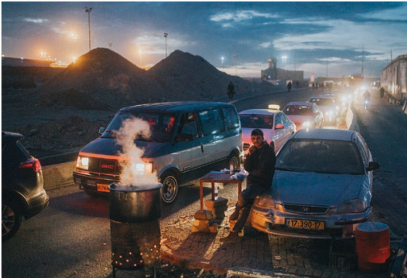
A man waiting by the cars going through a checkpoint in Ramallah, Palestinian Territories.

By asking, “What would it take to halve global violence in a generation?” foreign policy actors can begin to galvanise the partnerships that are needed to make a more ambitious approach to prevention possible.