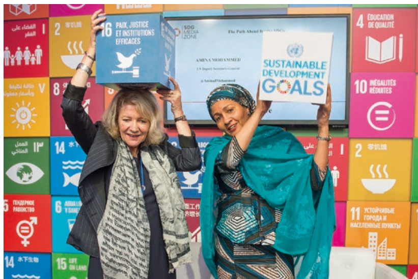
Deputy Secretary-General Amina Mohammed (right) with Alison Smale, Under-Secretary-General for Global Communications, at the SDG Media Zone.

The maintenance of international peace and security is the primary mission for the international system. 4 Given the interconnections between different forms of violence and conflict, effective prevention is only possible if it spans the spectrum of conflict and non-conflict violence. And given the ease with which risks proliferate across borders, a renewed commitment to collective action offers the only path to greater resilience.