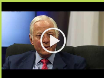
The Brian Tracy Show