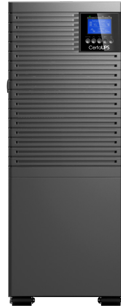
*Image shows 10kVA C550