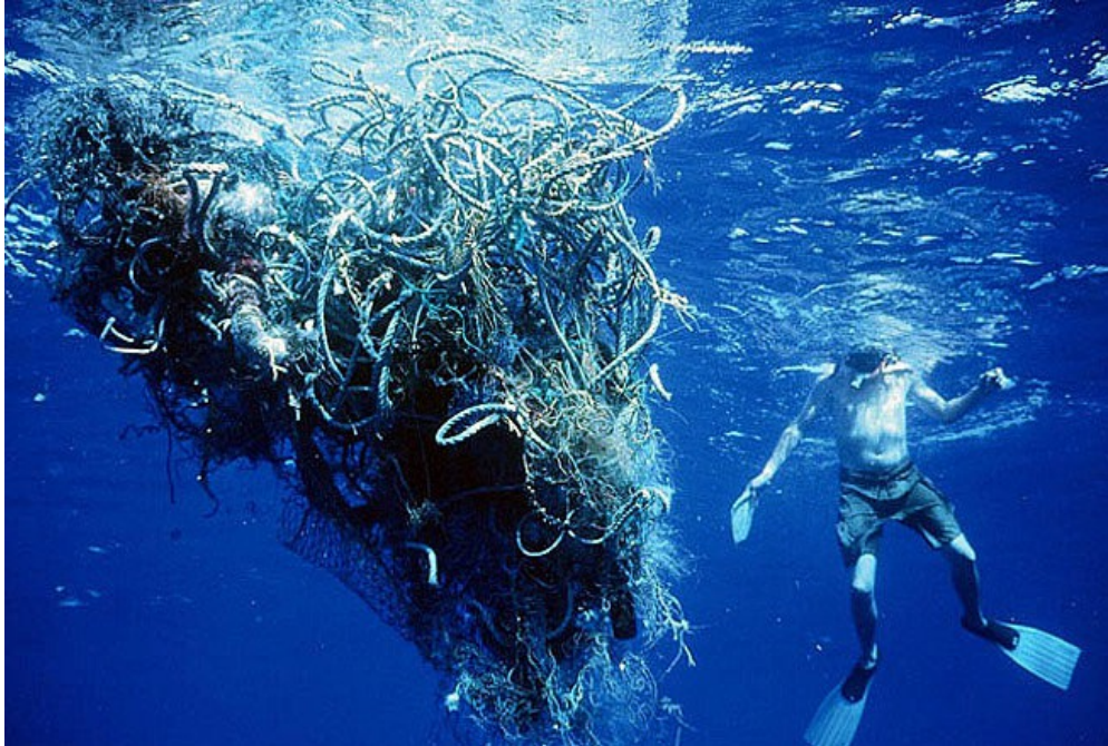
Fishing gear so easily identifiable.

Much of it's so obviously and easily identifiable as discarded fishing gear and again, more often than not, deliberately dumped over the sides would be my guess. With no witnesses other than themselves who knows what's going on out there? What's needed are whistle-blowers of course followed by crippling fines that would end these practices overnight and countries like Indonesia cleaning up their acts too.