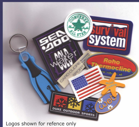
Logos shown for reference only

With Millions of Etiflex labels in service all over the world in some of the most demanding environments, you can be sure that we have the in the field experience and the right solution to help you design a custom label and attachment that will work for you!