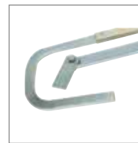
KIT OF 2 CURVED ARMS With brackets to be welded.