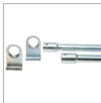
TRANSMISSION TUBES 2 galvanised tubes for central application. Length 1500 mm.