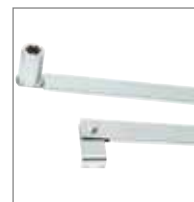
KIT OF 2 STRAIGHT ARMS With grooved welded bush. For side applications with 2 motors.