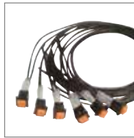
PUSH-BUTTONS 6 push-buttons for up-and over door.