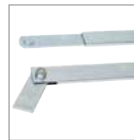
KIT OF 2 STRAIGHT ARMS With brackets to be welded.