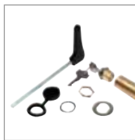
KEY OPERATED PLUG For external release system door thickness up to 45 mm.