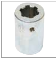
BUSHES Set of 6 grooved bushes.