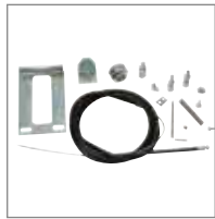
EXTERNAL RELEASE For application to existing handle