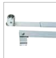
KIT OF 2 STRAIGHT ARMS With welded perforated bush.