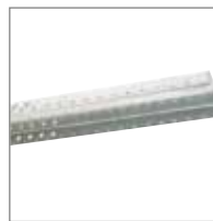
HEAD PROFILES Length 2000 mm.