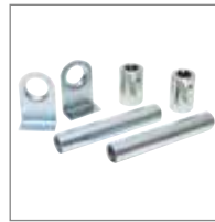
TRANSMISSION TUBES 2 galvanised tubes for side application. Length 200 mm.